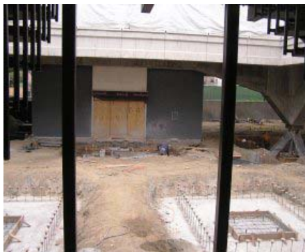
The center courtyard is closed to the public.