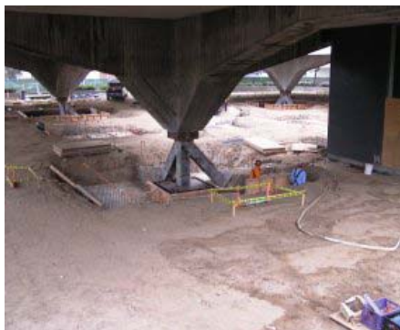
View of the work taking place under each of the four pillars.