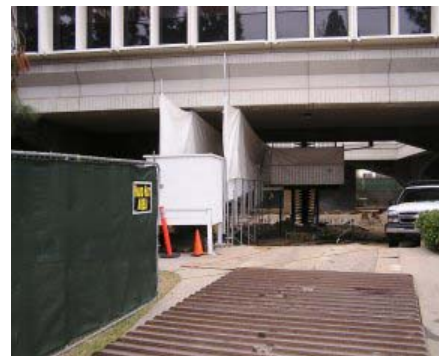
This is the ramp that connects the south stairwell / balcony to Parcher Plaza.