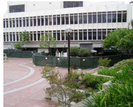
MSB Building - 633 E. Broadway. The entire perimeter is fenced, so access is different, but there are always two means of egress / access since the building is occupied during the work.

for the project is Greg Ahern, with plan review by Jeff Halpert.