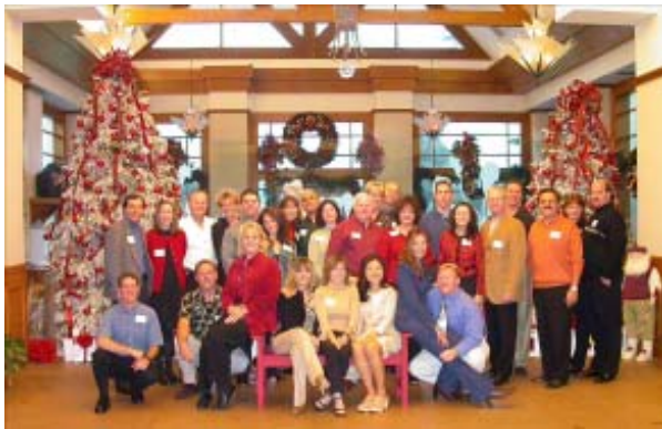
A Christmas party for Fire Prevention Bureau personnel and their spouses was held at Oakmont Country Club.