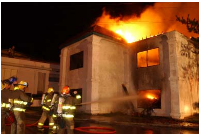
A third-alarm commercial structure fire occurred December 18 at 3800 La Crescenta Avenue in Montrose. Damage to structure and contents was estimated at $1.7 million.