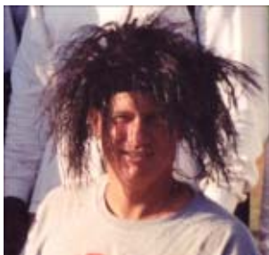
Escondido Fire Department Softball Tournament Record: 2-1. Excuse: "Our hair got in our way."