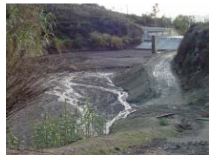
Brand debris basin on Dec. 17 after heavy rains.

Due to the hazards from falling rocks, burned shrubs and debris on the Brand Motorway and Brand Lateral, it is recommended that these roadways be closed to public use and signed accordingly.