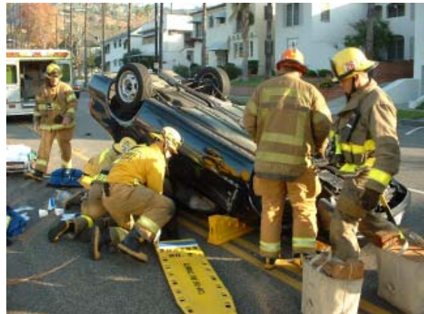
Personnel from Station 26 respond to a traffic collision on December 4.