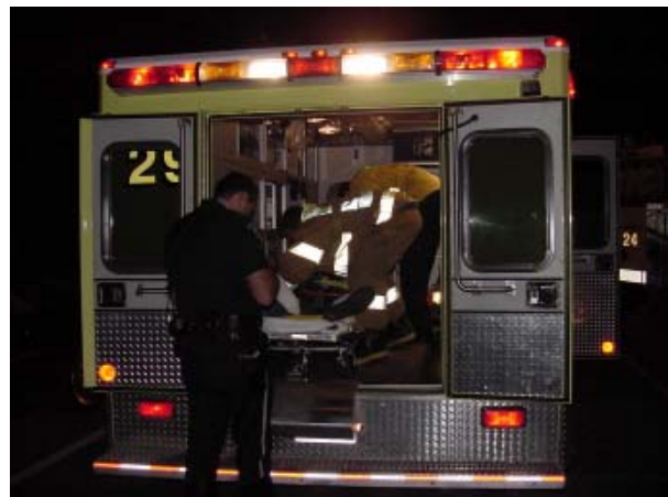
T29, E24 and RA29 responded to a traffic collision on November 17 where a car overturned and a motorist was injured.