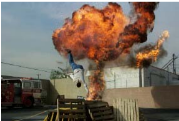
Staged pyrotechnic demonstration at the Training Center during the recent Film Officer Training course. Don't try this at home!