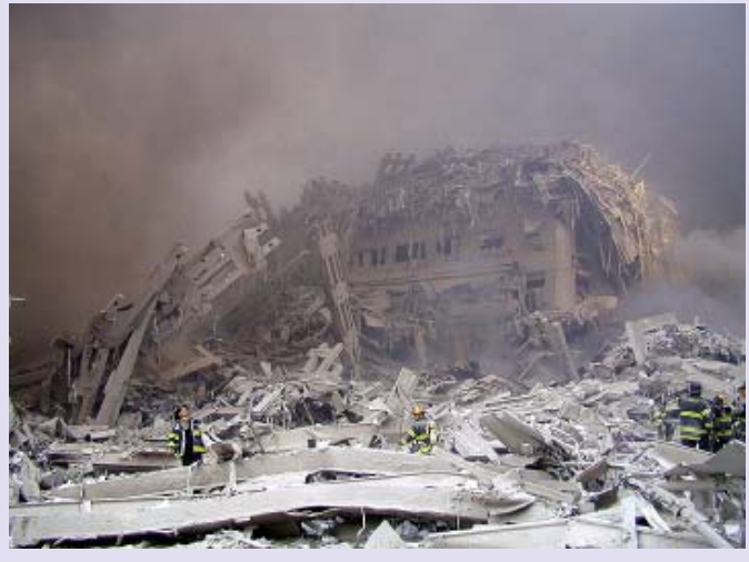
Firefighters sifted through the World Trade Center rubble following the utter devastation of the September 11 terrorist attacks six months ago.