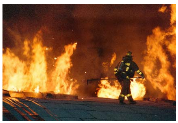
Five engine companies, two truck companies, RA21, HM27, and AU21 from the Glendale Fire Department assisted the Los Angeles Fire Department in responding to a structure fire at 4528 Brazil St. in Los Angeles on February 12.