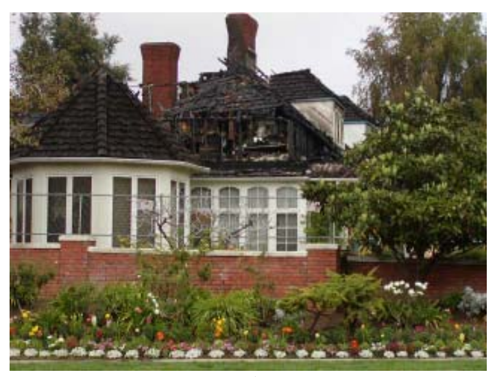
Initial damage estimates reached $2.5 million after a second-alarm house fire at 855 Holladay Road in San Marino on March 5. Fire companies from Alhambra, Arcadia, Pasadena, San Gabriel, San Marino, and South Pasadena responded.