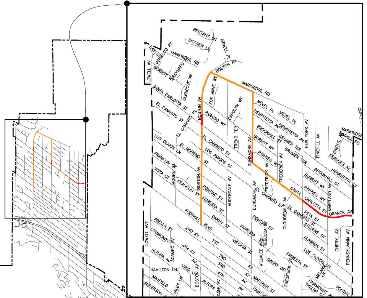
MAINTENANCE DISTRICT 12 T.G. 504-D5, D6, E5, E6, & F6