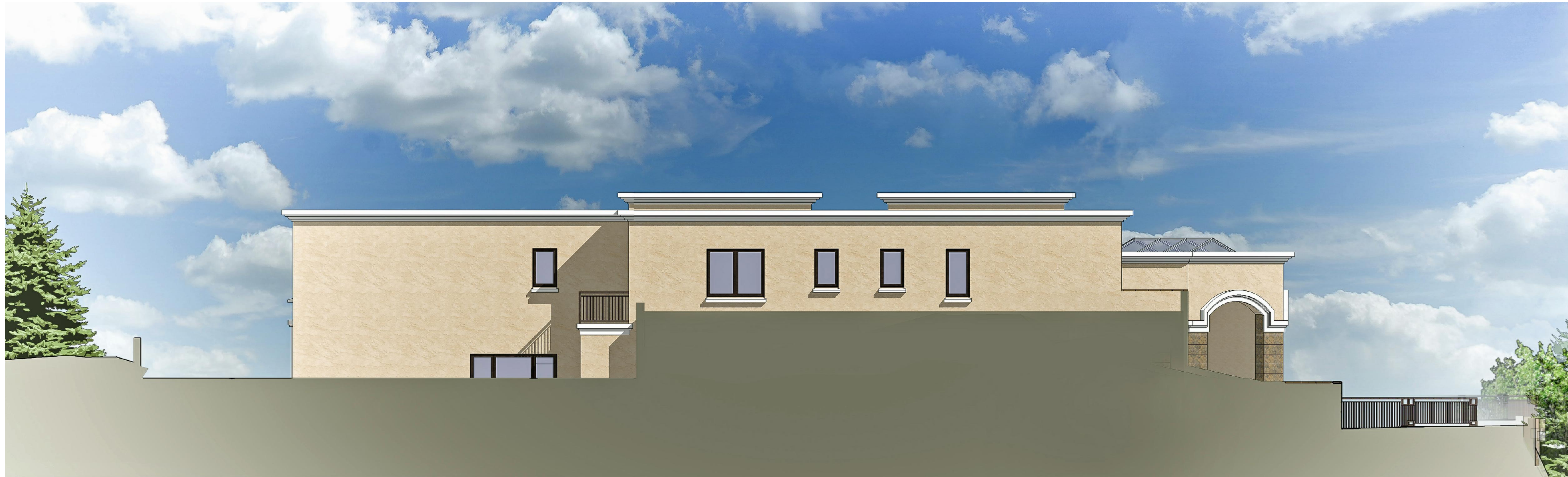
2 NORTH ELEVATION 3/16" = 1'-0"

EDWARD HAGOBIAN & ASSOC. INCORPORATED ARCHITECTS ARCHITECTURE / SPACE PLANNING / INTERIORS