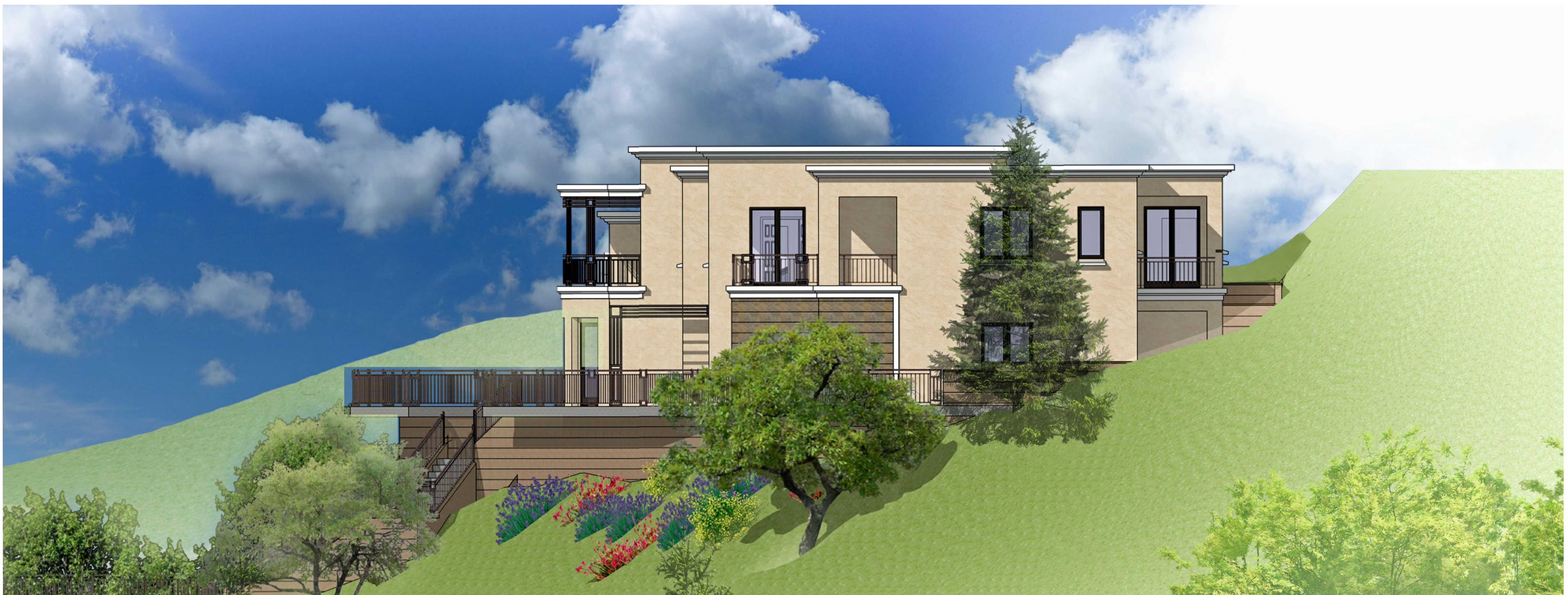
1 EAST ELEVATION 3/16" = 1'-0"