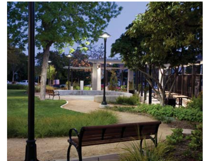
5 Glendale Heritage Garden