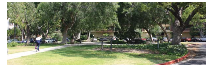
4 Piedmont Mini park