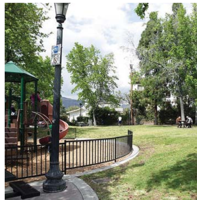
3 Wilson Mini Park