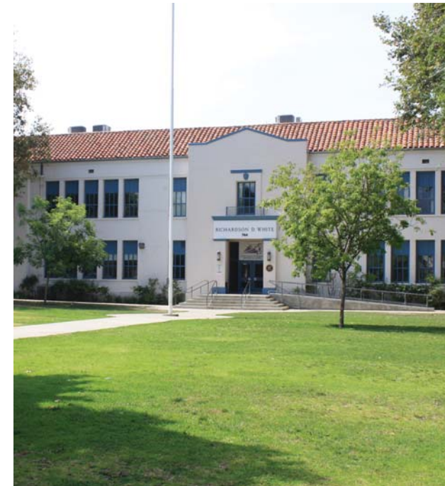
1 RD White Elementary School