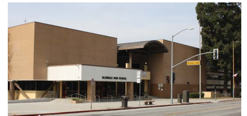
2 Glendale High School