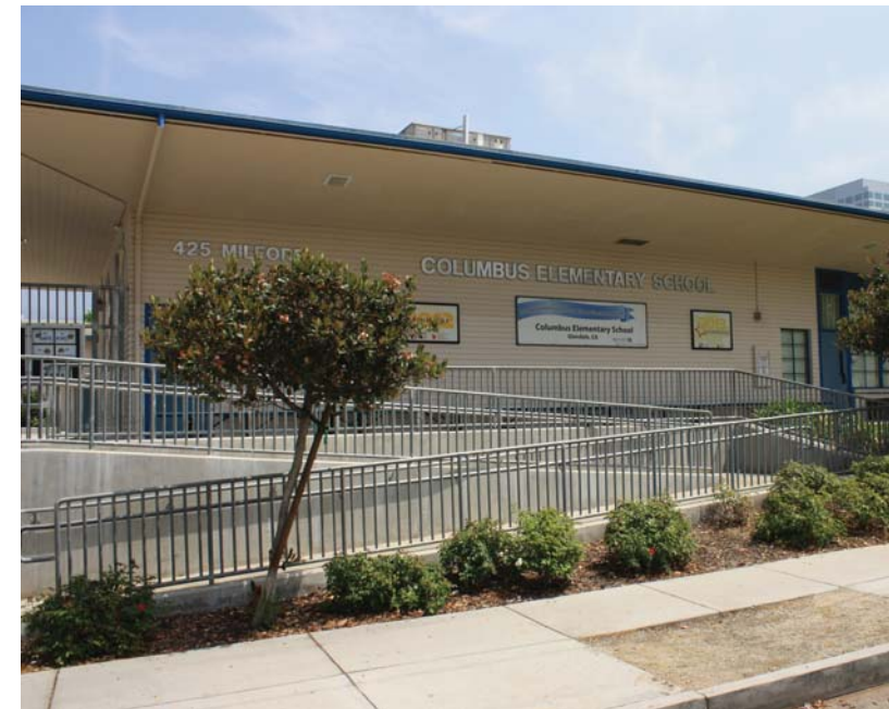
1 Columbus Elementary School