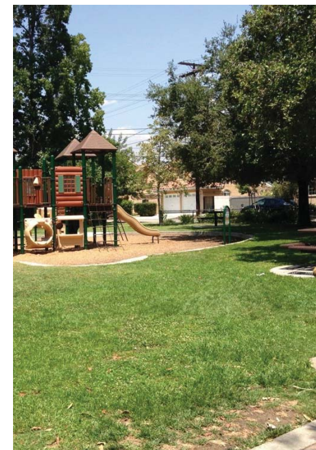
3 Milford Mini Park