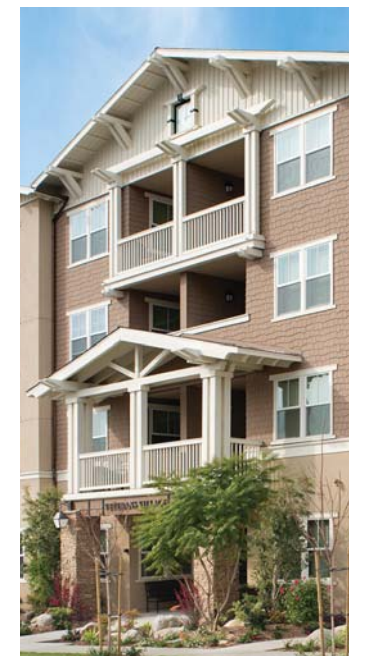
5 Veteran's Village