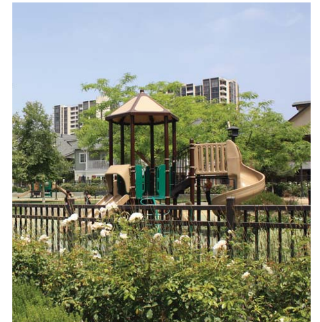
2 Doran Mini Park