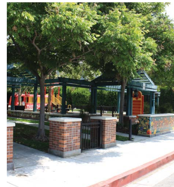
4 Harvard Mini Park