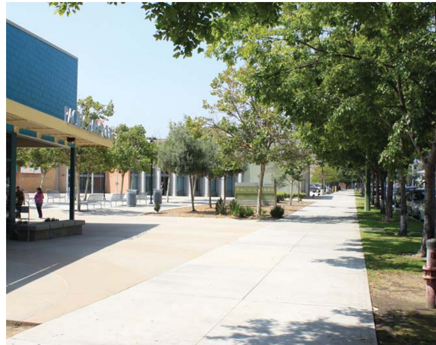
1 Pacific Park