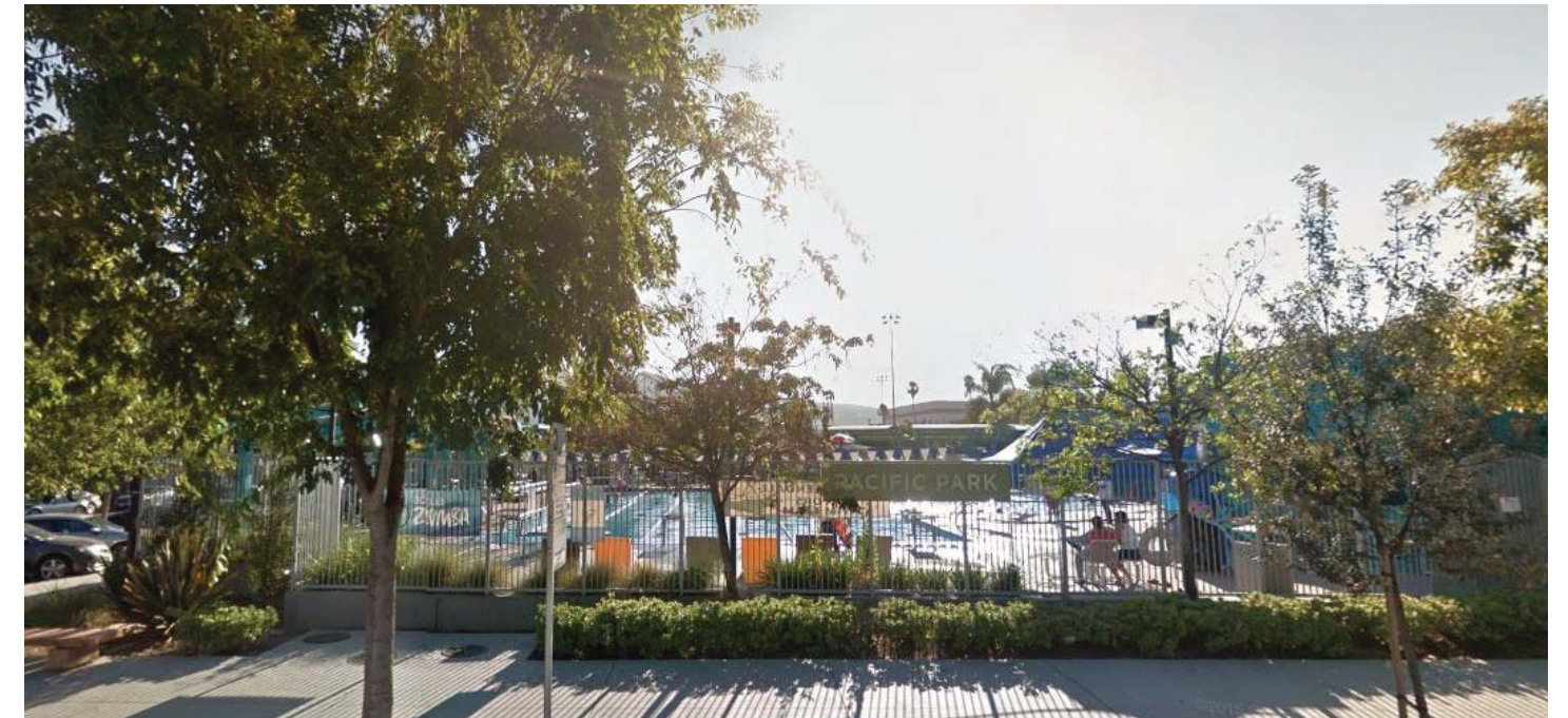
1 Pacific Park (Aquatics Center)