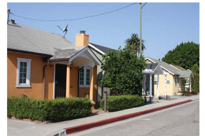
2 Neighborhood Street