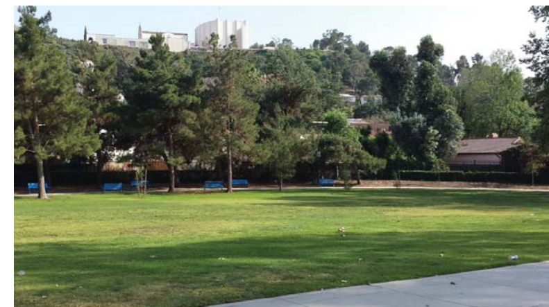
1 Palmer Park