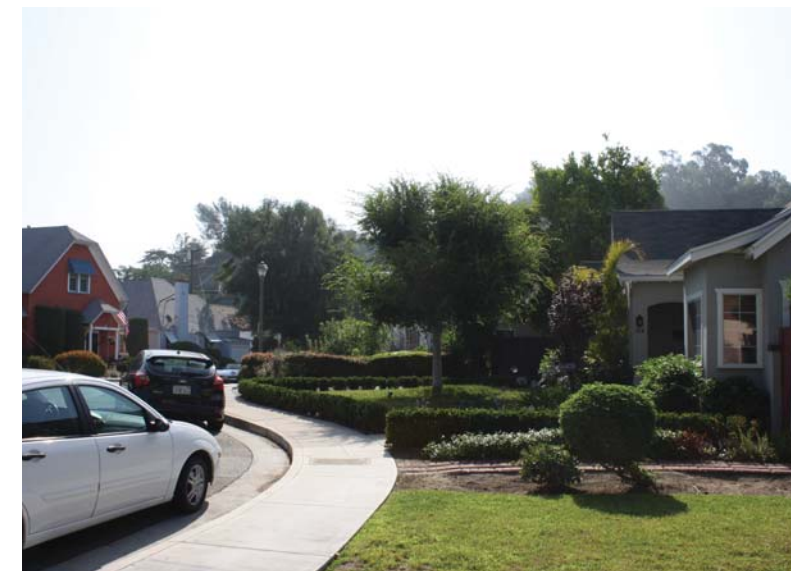
3 Neighborhood Street