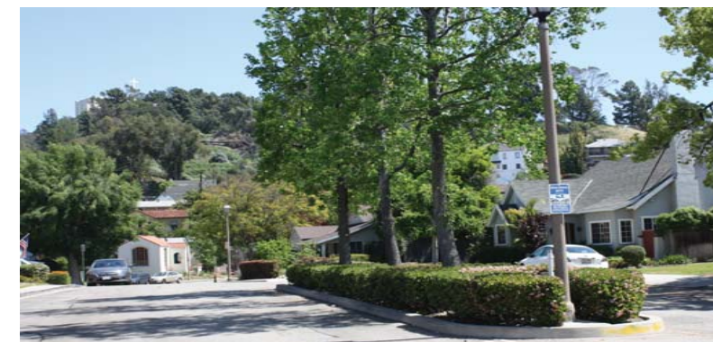
5 Road's End Entrance