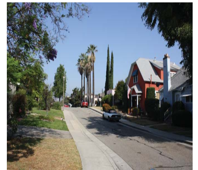
4 Neighborhood Street