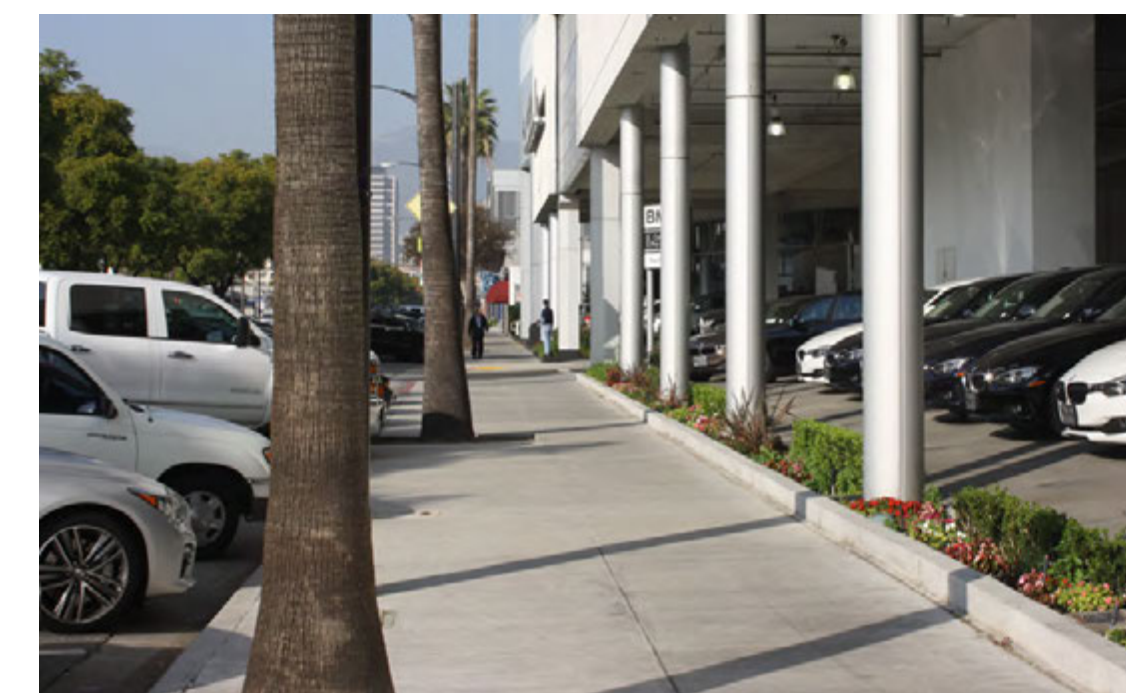
3 Brand Boulevard Sidewalk