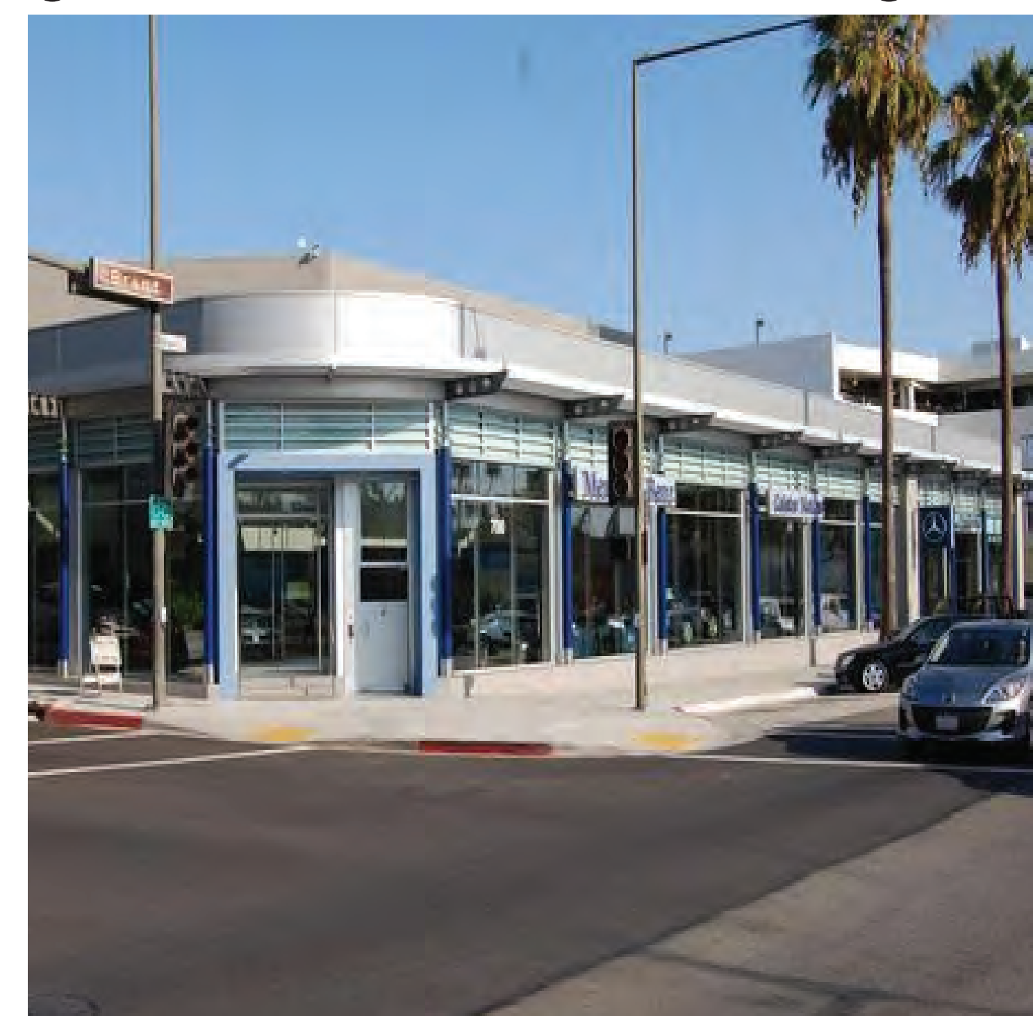
4 Calstar Motors