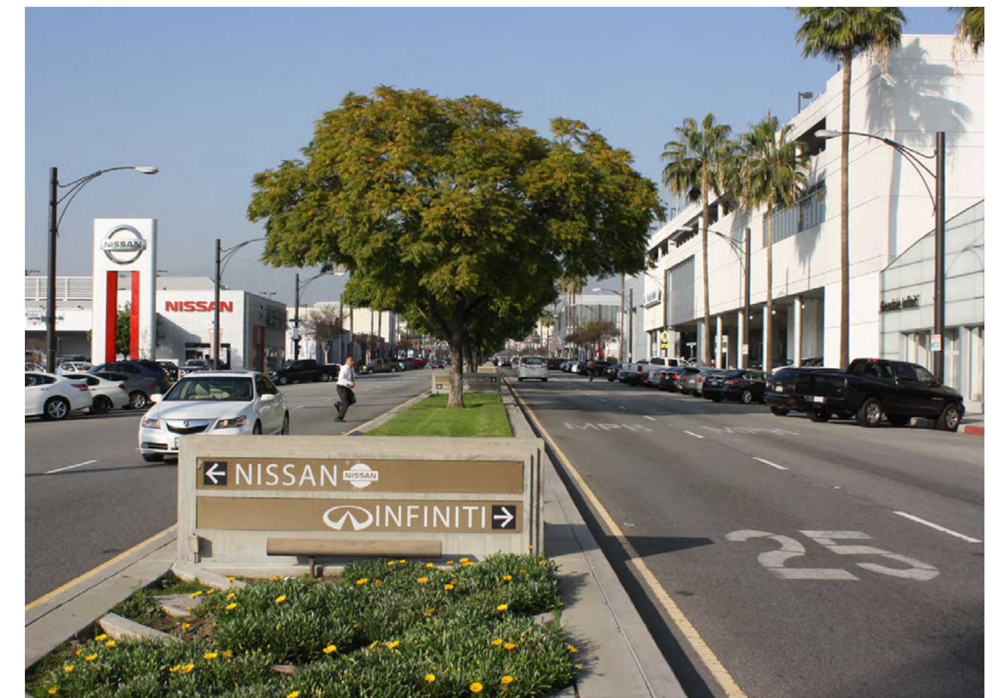
5 Nissan / Pacific BMW