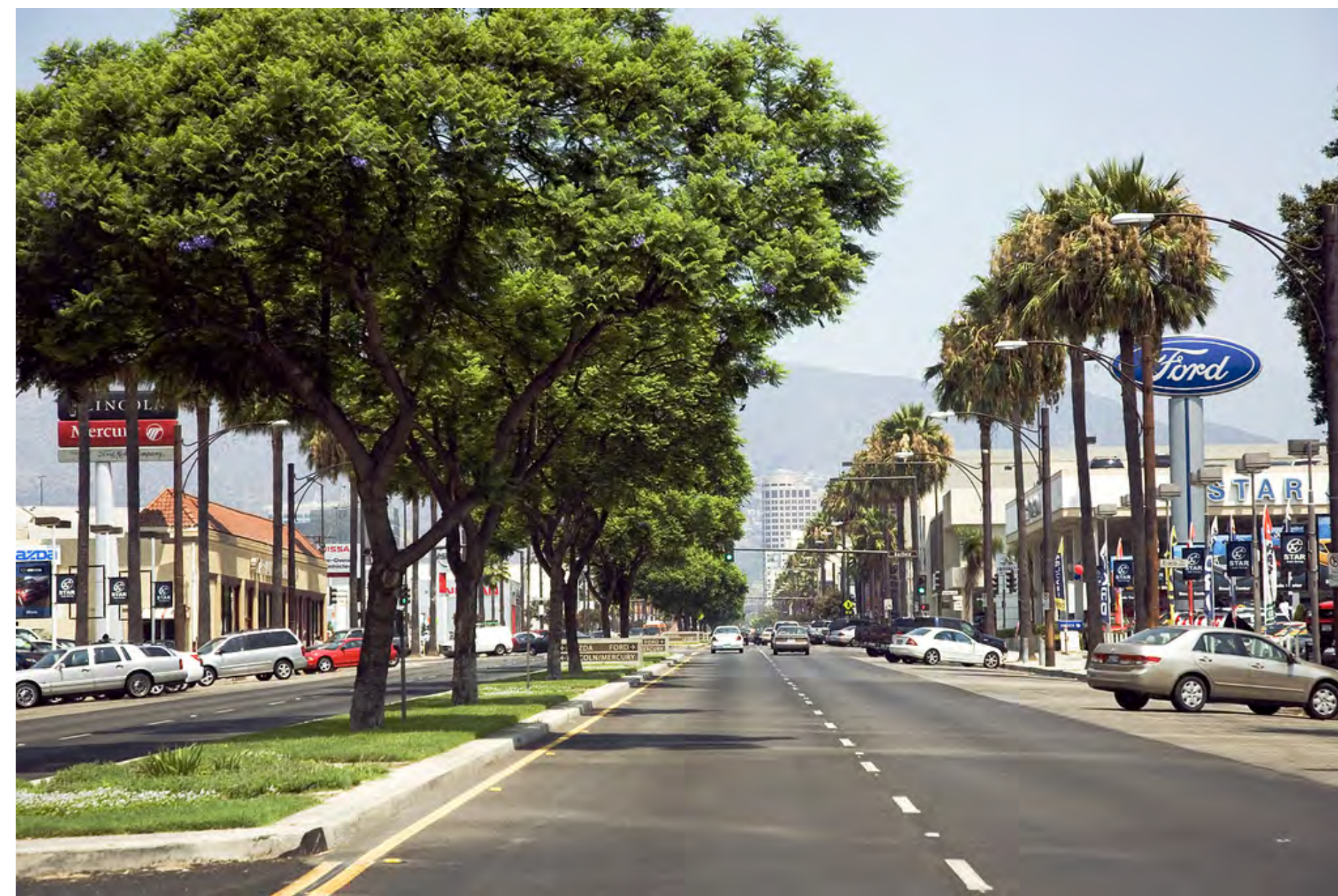
1 Brand Boulevard of Cars Corridor