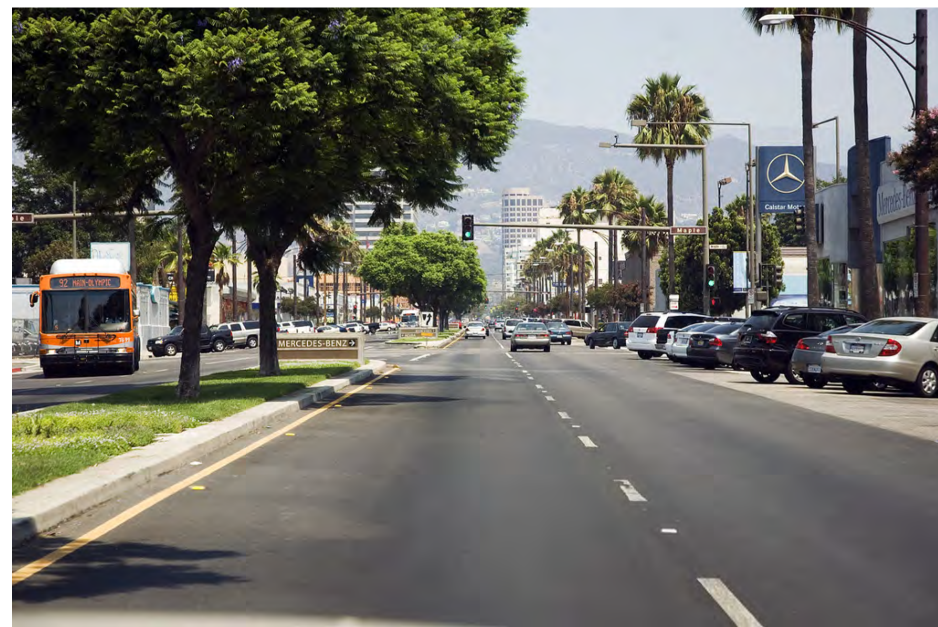
2 Brand Boulevard of Cars Corridor