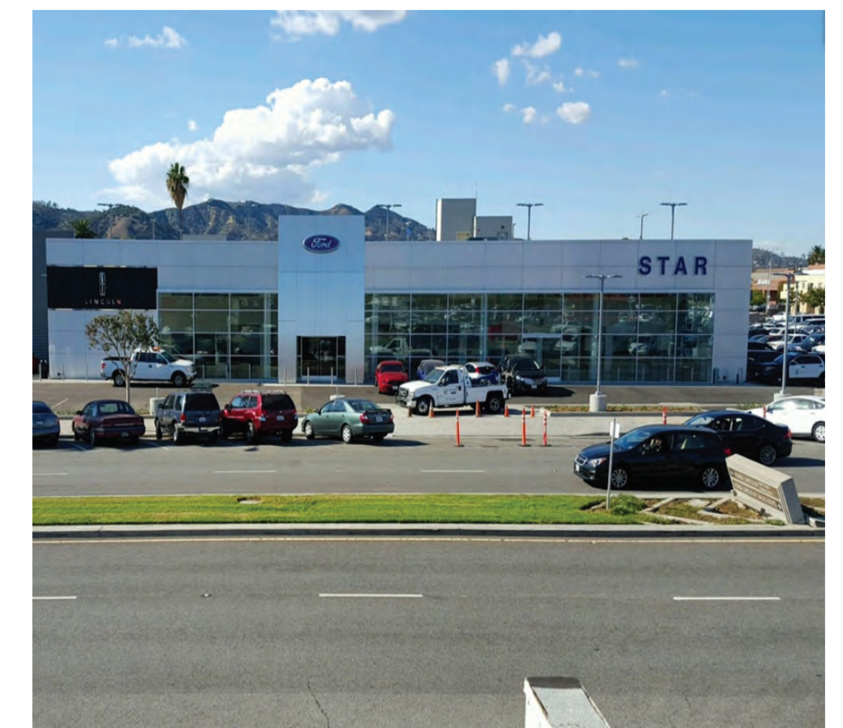
6 Star Ford