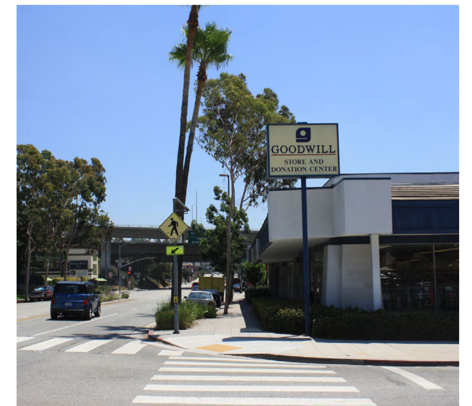
4 Colorado / Lincoln