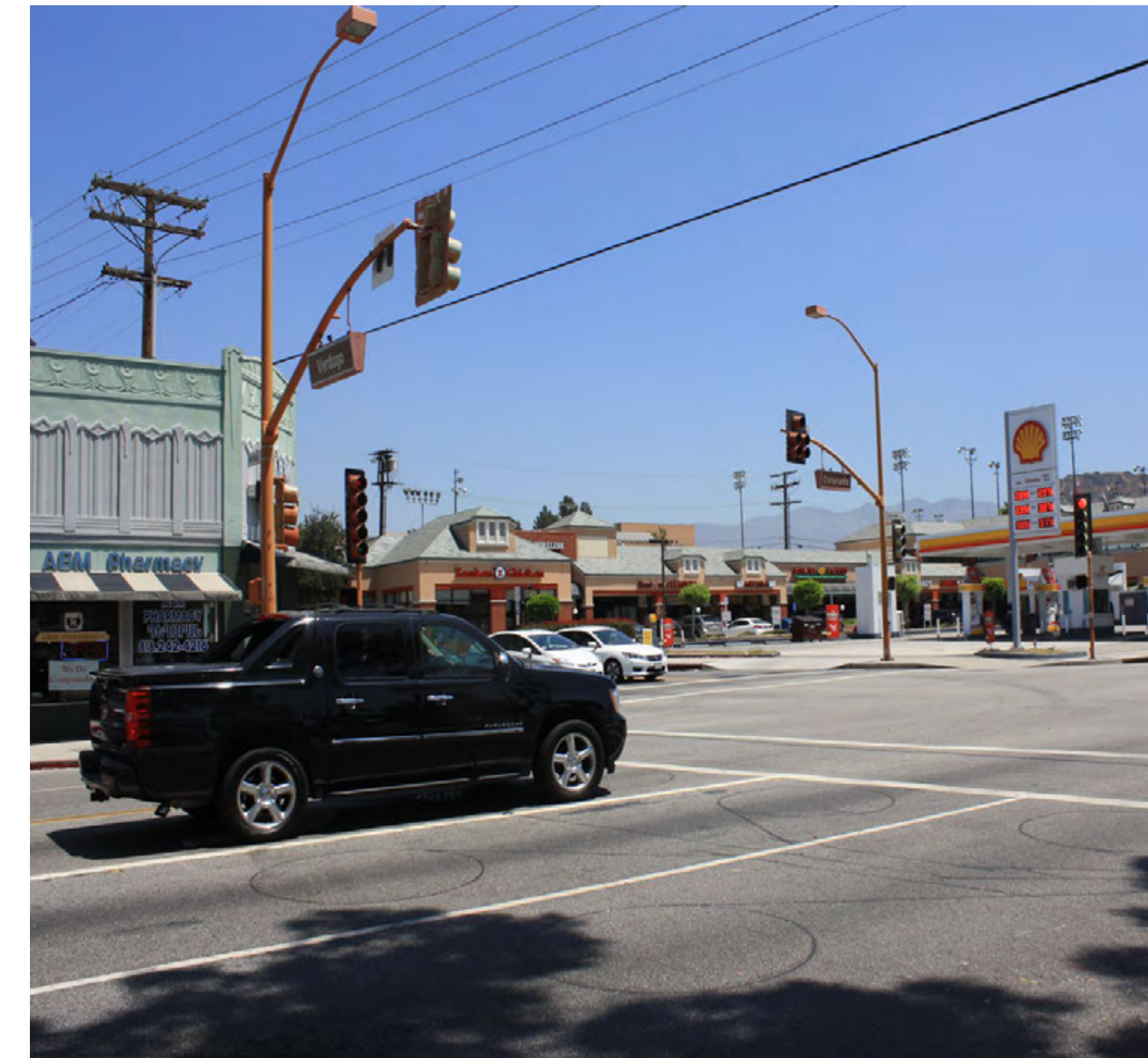
1 Colorado / Verdugo