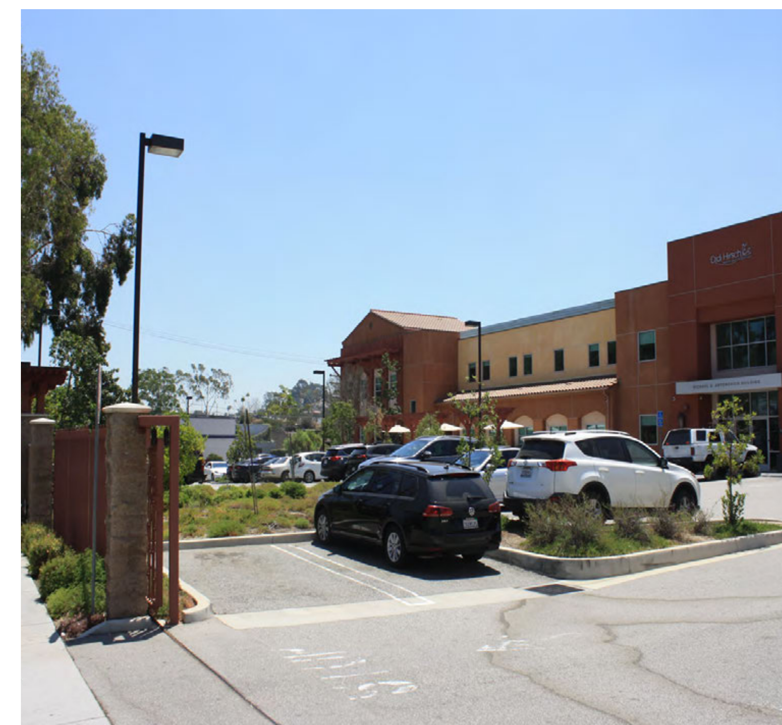
3 Medical Center