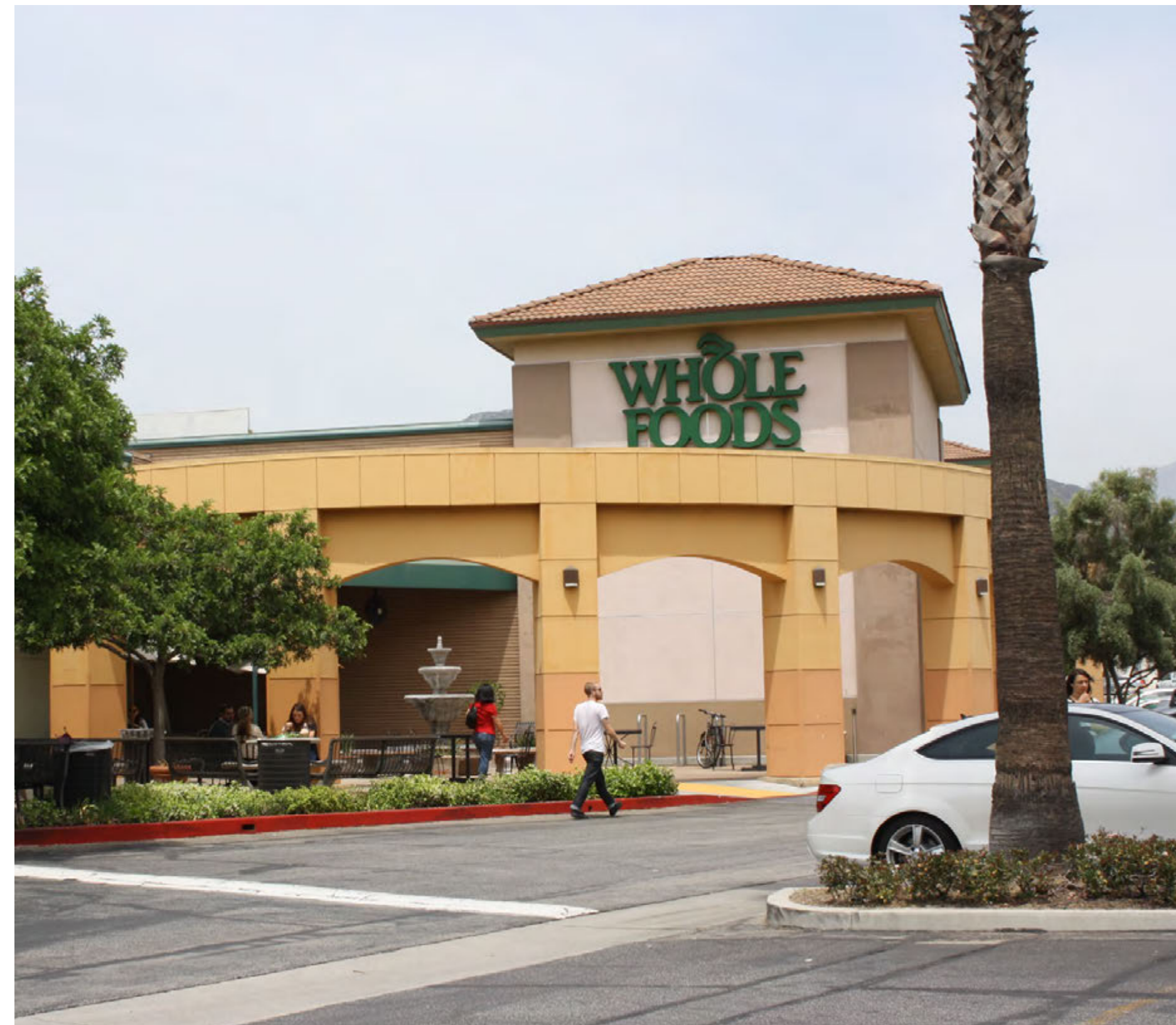
1 Whole Foods