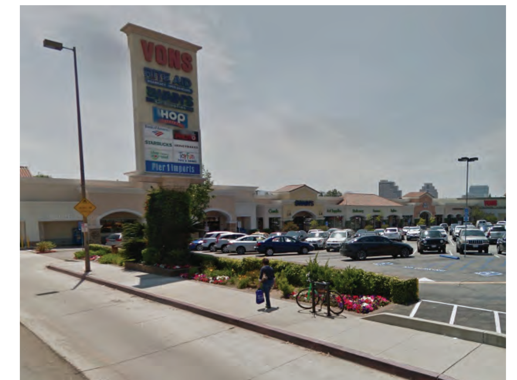
6 North Glendale Shopping Center