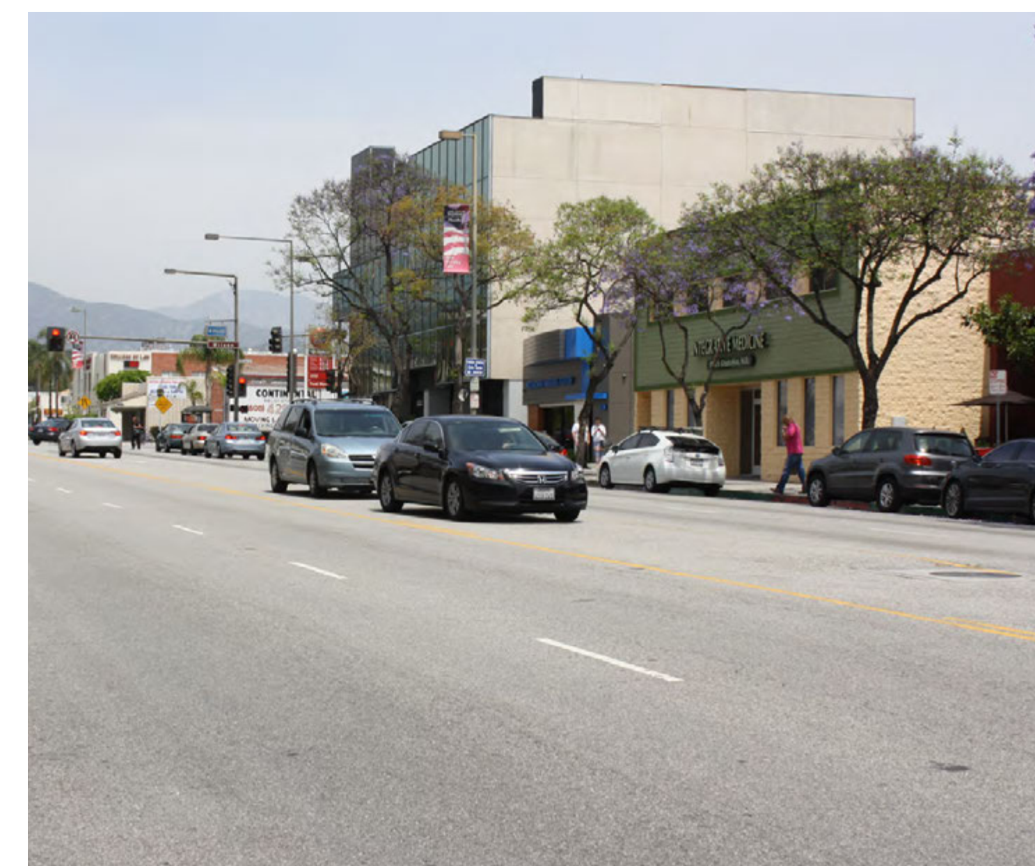
4 North Glendale Storefront / Office