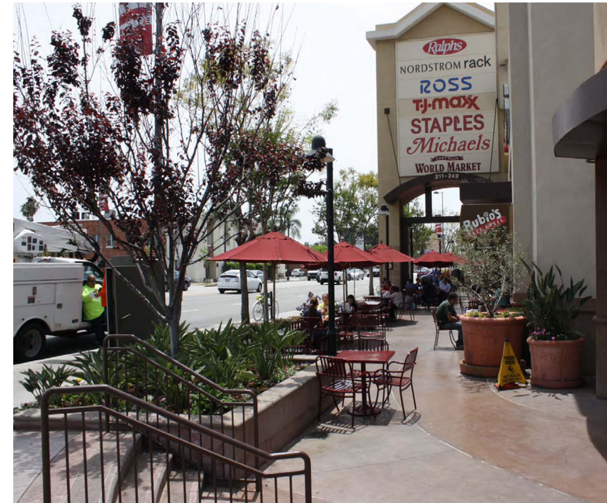
3 Outdoor Dining Plaza