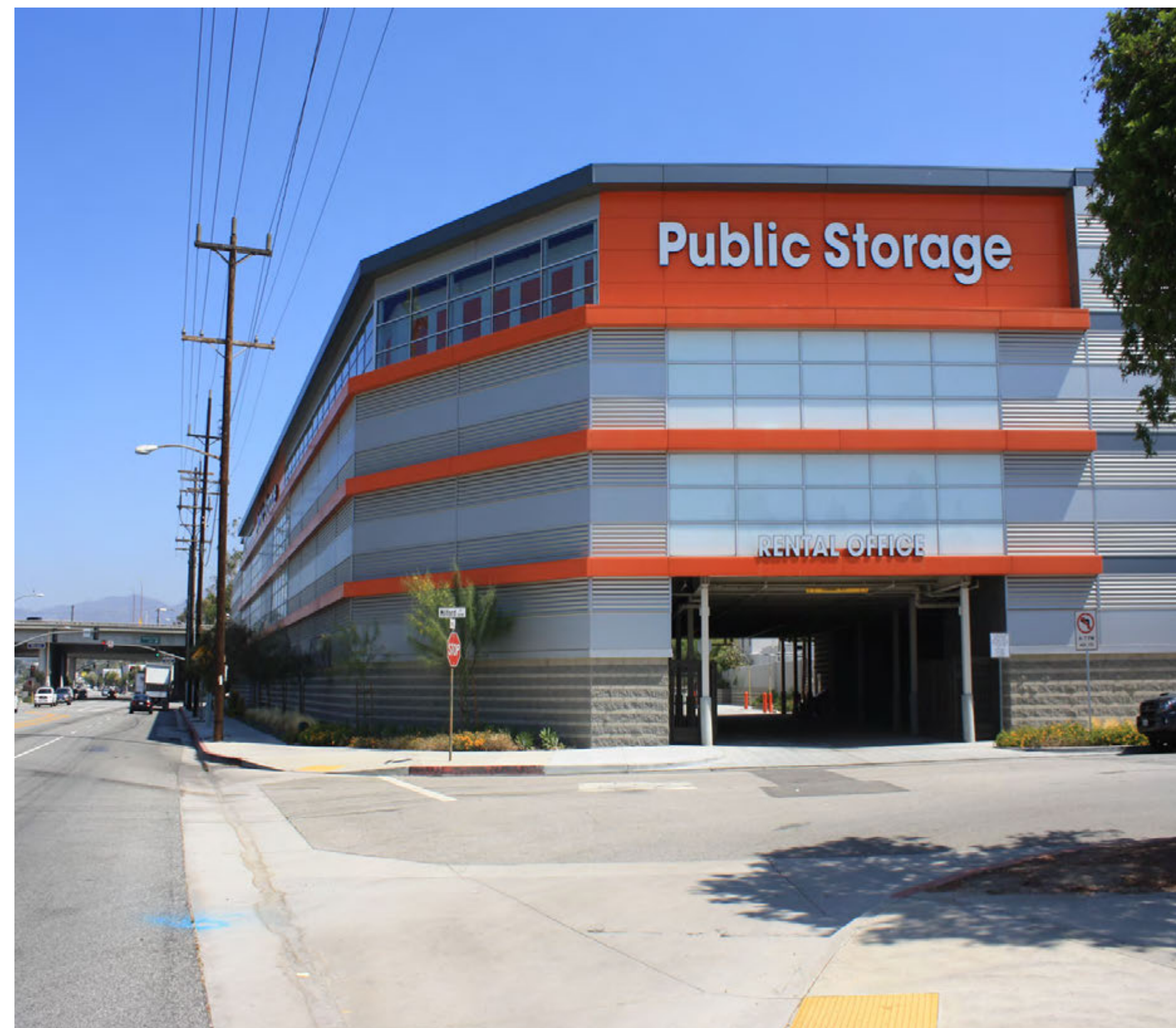
1 Public Storage