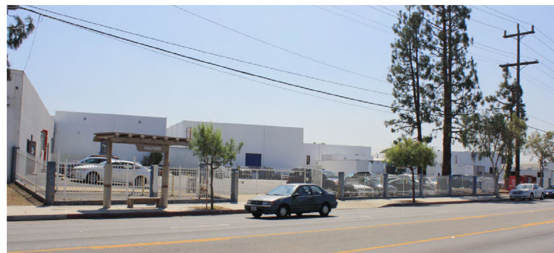
2 San Fernando / Milford