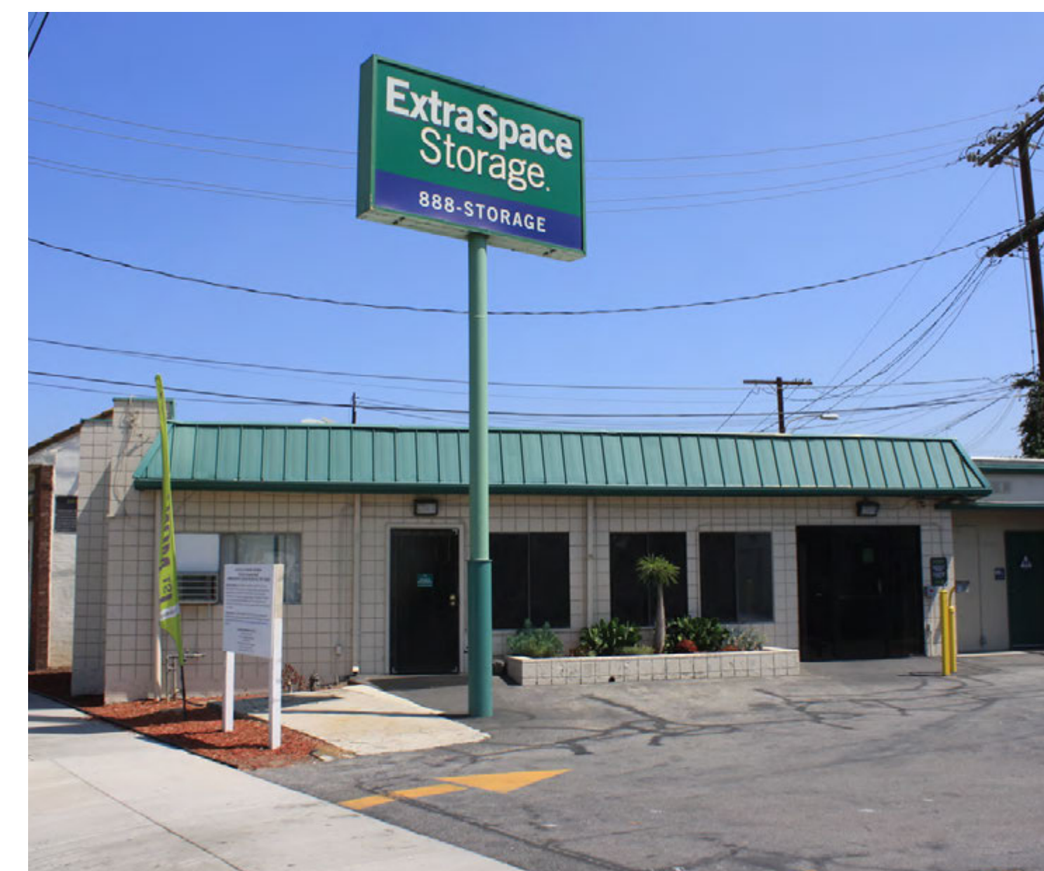
4 Extra Space Storage