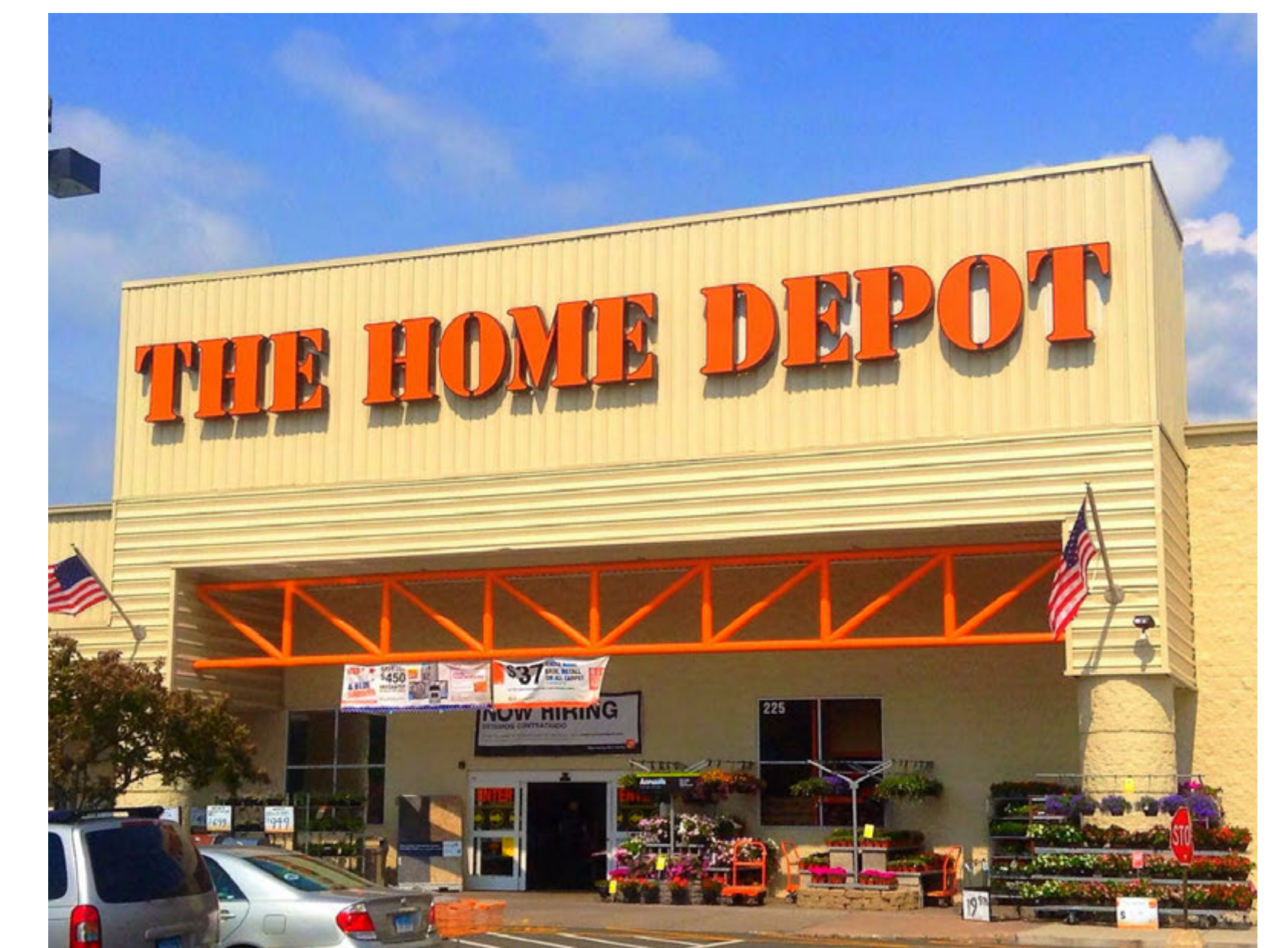
6 The Home Depot