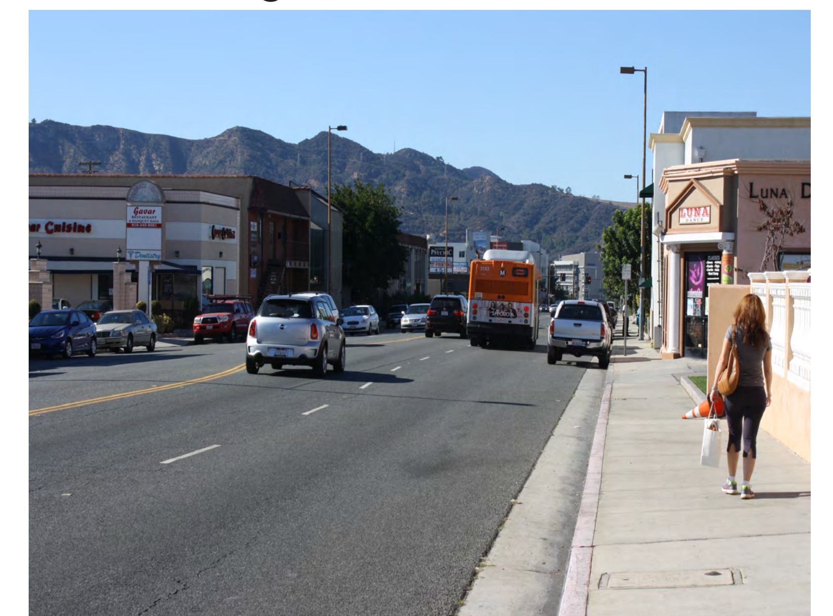
4 Colorado Boulevard