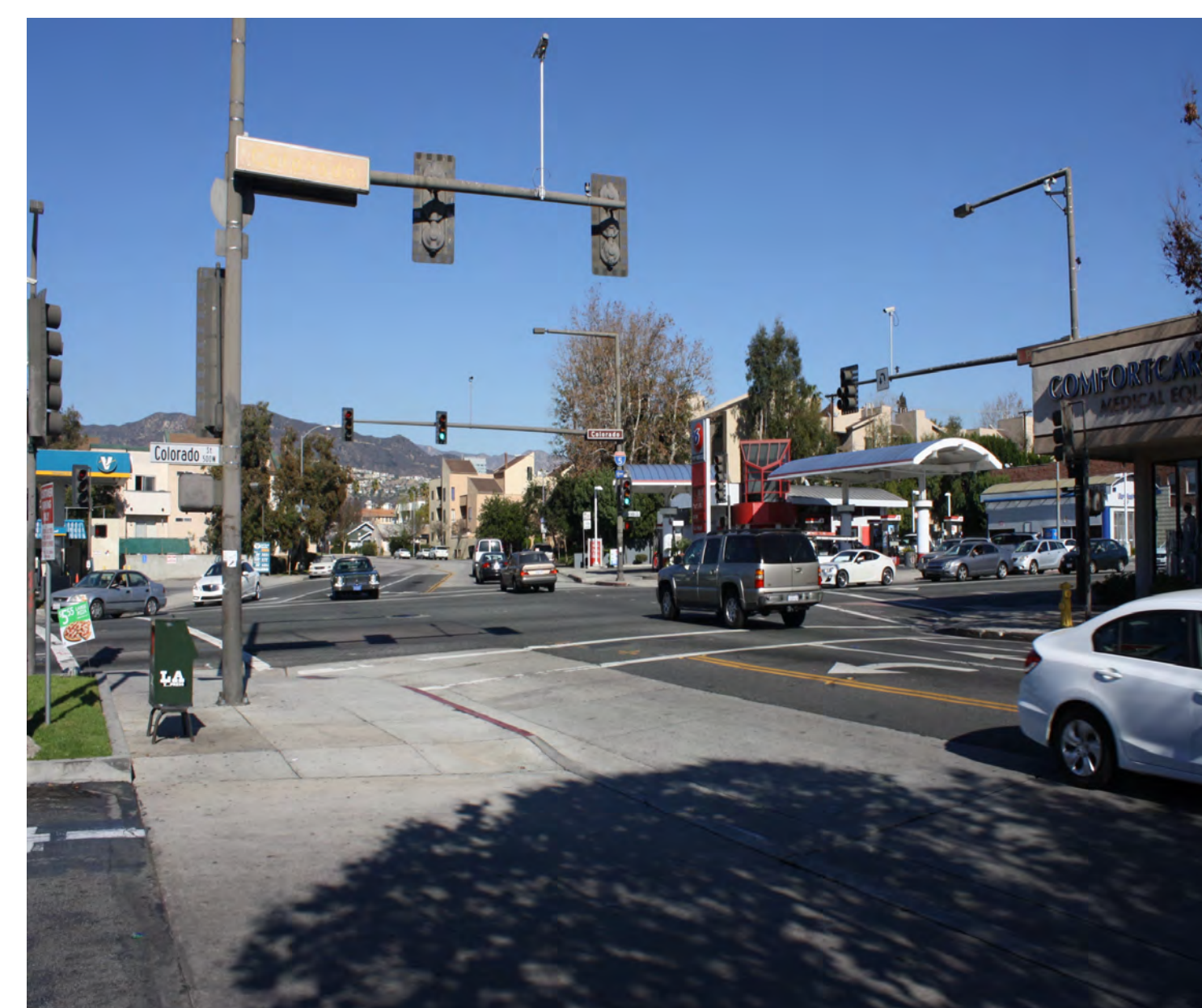
3 Pacific / Colorado