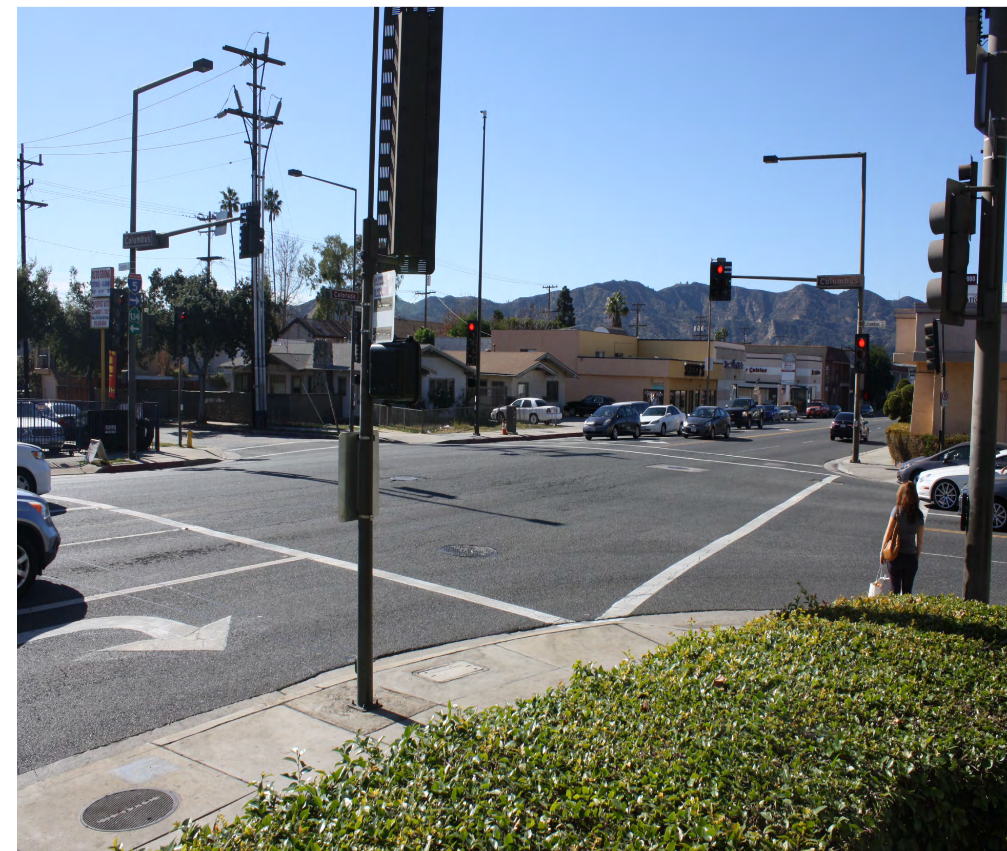
1 Columbus / Colorado