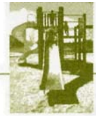
MAP 4-1 PARK FACILITIES