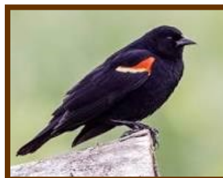
Red Winged Blackbird