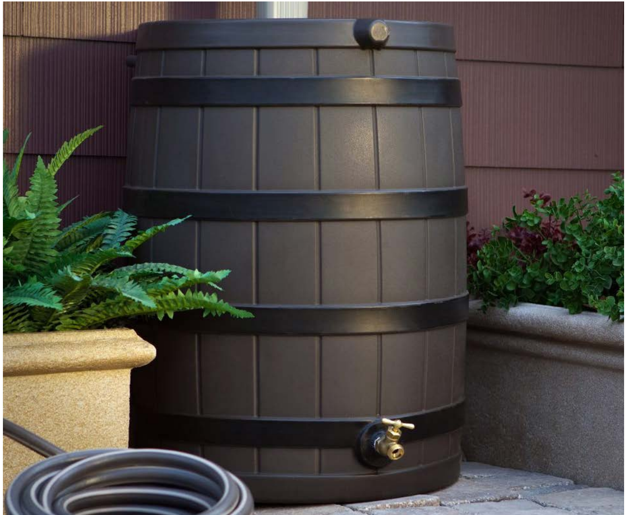
Rain Barrel Distribution Event