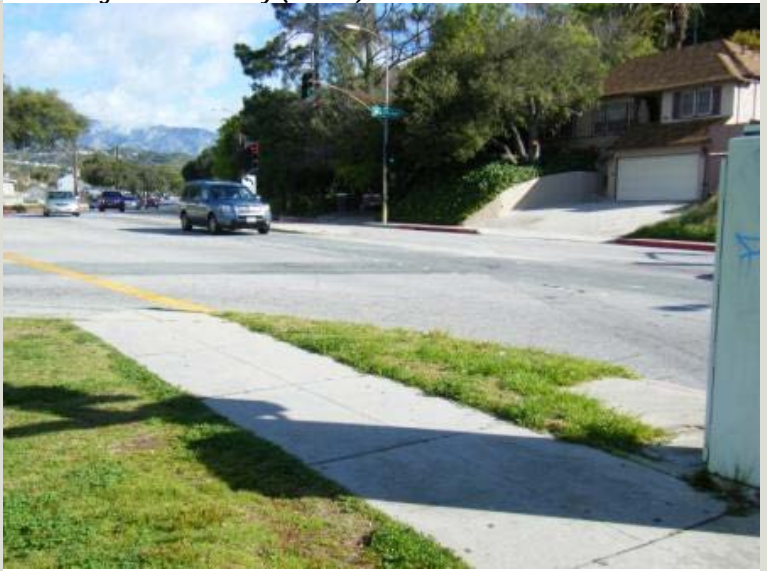
Verdugo and Monterey (after)