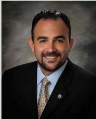
Glendale City Manager

Happy (Fiscal) New Year...July 1st has come and gone, and a new budget is being implemented.