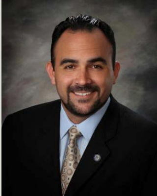
Glendale City Manager

Going through my iTunes music collection reminded me precisely why I love this time of year. Sentiment and reflection, for better and for worse, permeate every aspect of the season--from the crisper weather, to the shorter days, to the sense of anticipation in the eyes of children, to the respective (and mostly cheerful) attitudes of family, friends and coworkers, to the mere faces of people on the street. And there is a song for each mood, each person.