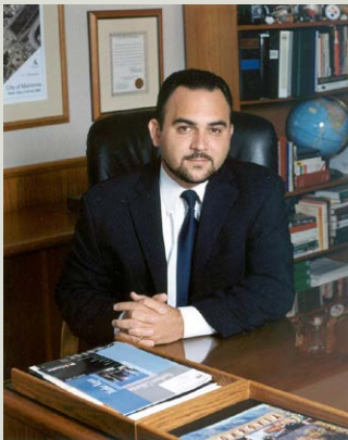
Glendale City Manager

As we move into the new year, we are pleased to present a new appearance for City Connection. In only the first two months of my time with Glendale, we have already entered a new year, a new look, and now have to focus on a new strategy for economic development. The loss of economic stimulation and job creation previously provided by the Redevelopment Agency will have an impact on Glendale. The City is committed to ensuring Glendale's economic viability, and will work tirelessly to maintain the quality of life our community expects.