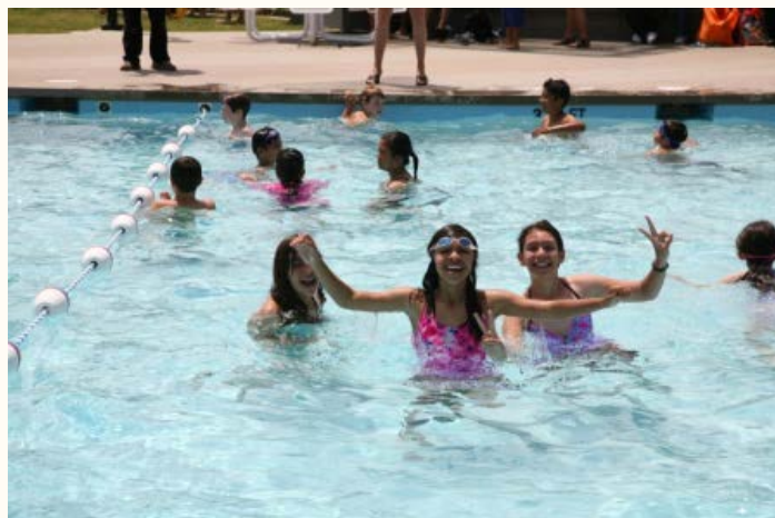
Wading pools will also be available for both public and private use