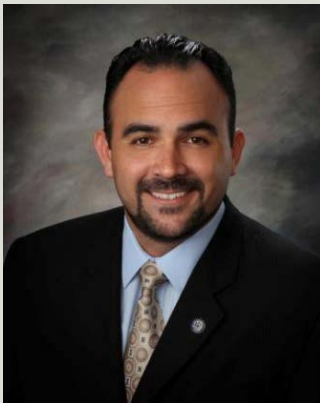
Glendale City Manager

During the past few years, municipalities such as Glendale have undergone severe "belt tightening" in response to the national and statewide economic crises. Consequently, cities have come to depend more and more on businesses, church and school groups, non-profits and individual volunteers who donate time, money and effort to ensure that we are still able to offer special events, programs and services to the community. For example in 2011, Glendale donors--both large and small--came together to preserve the City's 98th consecutive entry to the Tournament of Roses. Community organizations are already joining hands to help fund and construct the 2013 entry. Another great example is the work being done at the Monterey Eco-Garden. Volunteers and businesses (the Home Depot in particular) have partnered to reuse this property for the benefit of the entire community.