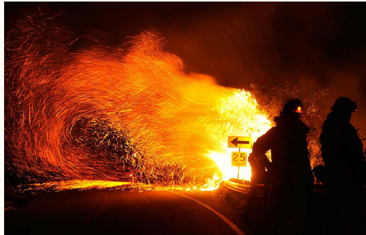
Station Fire, August 29, 2009

But it is a critical part of keeping homes from igniting during a wildland fire.