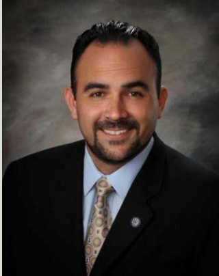
Glendale City Manager