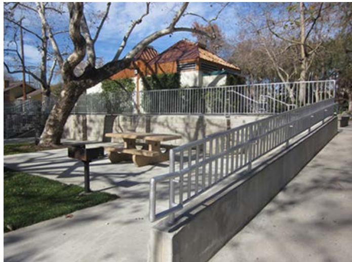
The Carr Park Renovation project, which was completed using

The Brand Park Entry and Gates project is now complete! The historic setting and architectural significance of the site were taken into consideration for this project. The new gates at the main entrance were set back from the entry point to give prominence to the existing and newly restored historic gates. Design elements of the ornate motif on the existing gates were introduced on the new gates to balance old and new. To complete the refurbishment, a fresh coat of paint was applied to the historical entry and exit columns.