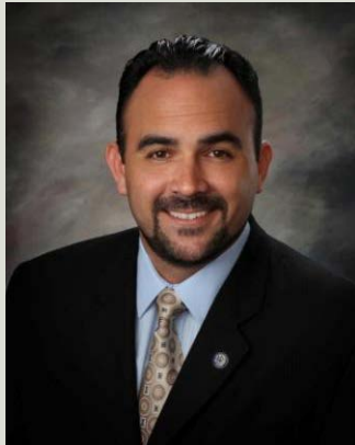
Glendale City Manager

I have been married to the same beautiful, smart, sensitive, funny, stylish, loving woman for nearly eighteen glooooooorious years; and February is a special month for us, enveloping our marital bliss in a cocoon of joy and intimacy that renews itself each spring, like a wondrous butterfly that is simultaneously delicate and durable, emerging into a world that demands a safe harbor of love and understanding in order to withstand the unceasing storm of life's pressures and problems, and which replenishes our hearts with the indescribable sense of delightful longing and anticipation that drew us together in the first place.