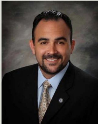
Glendale City Manager