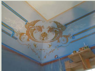
Repainted ceiling at Brand Library.