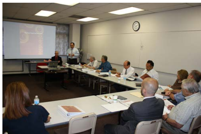
Staff addresses the Task Force at their inaugural meeting.

The Community Development Department has assembled a Planning Process Task Force (PPTF) consisting of community leaders who are familiar with current Planning & Neighborhood Services application review and regulation processes. The PPTF will examine the review these procedures in an effort to maximize their efficiency, while preserving high standards, public input and discretionary reviews. The Task Force will meet during the summer to discuss such topics as: design review, conditional use permits and zoning use certificates. Please visit the Planning Process Task Force webpage for more information.