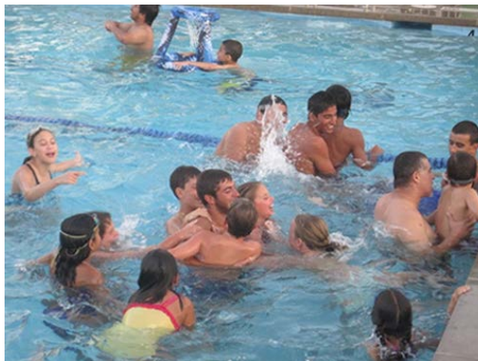
Families enjoying the Pacific Community Pool.