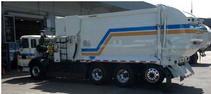
Residents are likely to see this Autocar Wayne Curbtender with 31 cubic yards capacity in residential areas.

Be on the lookout for new Compressed Natural Gas (CNG) refuse vehicles and street sweepers in your neighborhood. The Public Works Integrated Waste Management Division recently purchased CNG vehicles with partial funding from the South Coast Air Quality Management District. These vehicles enhance Glendale's air quality, replace aging fleet, and improve driver efficiency and fleet uniformity. Fifty-one percent of the City of Glendale's Integrated Waste Management fleet runs on CNG.