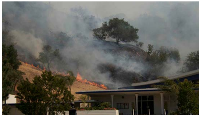
A photo from the Wilson Terrace Fire on May 3, 2013.

Every year, California experiences wildland fires that burn acres of land, displace families, and endanger the lives of firefighters. There are a number of areas within the City of Glendale that are considered to be high fire hazard severity zones. The Glendale Fire Department (GFD) partners with mutual aid agencies, such as Burbank and Pasadena, to conduct drills which aim to improve communications, establish unified command, and practice brush fire tactical operations because of a unique understanding of the terrain. Wildland fire training and exercises are critical to the safety of the firefighters and enhance GFD's ability to protect the residents of Glendale, especially during summer months with low precipitation and extremely dry fuel.