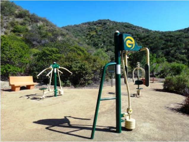
Fitness equipment along the Mountain Do Trail.

Community Services & Parks is excited to announce the grand opening of two new trails in Glendale: Mountain Do and Catalina Verdugo. The Mountain Do Trail is a 0.75 mile long fully accessible, decomposed granite path around the Glendale Sports Complex. The trail has three bridges and two rest areas that contain benches, tables, interpretive signs, and fitness equipment.