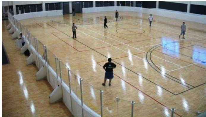
Indoor soccer rink set up.