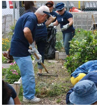
A volunteer rakes debris at the 2013 Great American Clean Up.

June 27 - GWP Community Meeting, 7:00-8:30 pm Pacific Edison Community Center