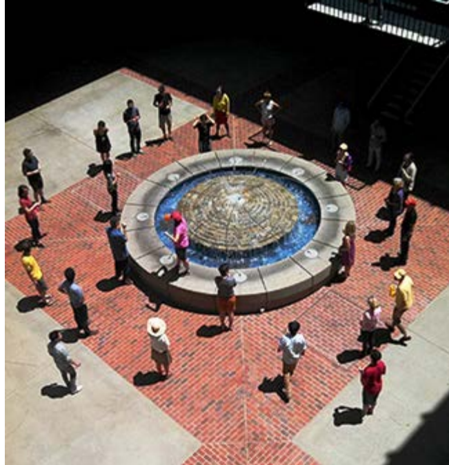
An overhead shot of the performance held on May 19, 2013.

Details to follow next month. For more information on the event and to register, please visit Glendale Golf Championship .