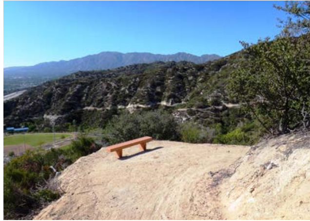
A view from the Catalina Verdugo Trail.

Sports Complex. This trail contains interpretive panels, benches at overlook points, and a link to the Ridge Motorway.