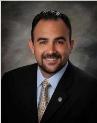
Glendale City Manager

As we head into March, we got a nice reminder that we actually did have a winter this year - the recent rainstorms dumped more than 5 inches of rain on Glendale over the last few days. Even nicer was the reminder that our employees - particularly the members of the Public Works, Water & Power, Police and Fire Departments - were prepared for the problems that accompany such torrential rains. Despite the challenges of mudslides caused by last year's brush fire in Chevy Chase Canyon, our crews worked through the weekend to keep streets clean and safe. It took great effort among scores of people, but the rainstorms presented little more than an inconvenience to Glendale residents and businesses.