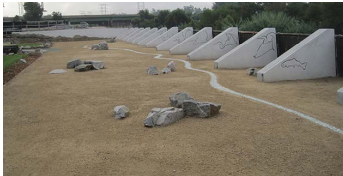
The spillway and flood gates along the Los Angeles River have been incorporated into the Riverwalk public art project. The flood gate wing walls show an egret rising over a symbolic representation of the river.

Phase II of the project, slated for construction next year, will continue the recreational trail eastward and will include an additional park, a river overlook, and a gated entry area. Phase III, the final phase for the project, envisions a bridge from the Riverwalk across the river into Griffith Park, providing an opportunity for Glendale residents to access the largest urban park in the county, and providing Los Angeles residents a gateway to all that Glendale has to offer.