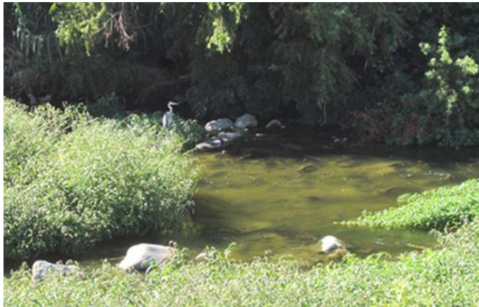
Blue heron in the Los Angeles River adjacent to the Riverwalk site. The river channel has a soft bottom in this area with dense vegetation and a wide variety of bird species.

Join the LA Opera Speakers Bureau at 2:00 pm on Saturday, November 17, at the Central Library Auditorium (222 E. Harvard Street) for a brief retrospective of silent films that used operatic plots and musical themes in their piano scores. Visit Opera Talks for more information.