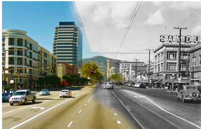
Brand Boulevard, looking north toward Harvard Street

The right side of this image is from 1934, when the Famous Department Store was Glendale's destination for men's and women's clothing, luggage, dry goods, and more. The Red Car lines and tracks are visible down the center of the image. The left side of this image depicts the current view of Brand Boulevard including the Americana at Brand.