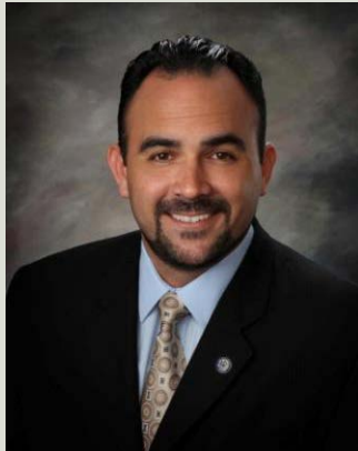
Glendale City Manager

There has been a lot of discussion around town regarding the alphabet soup of City finances - GFT, UUT, etc. To date, there are two lawsuits filed against the City regarding the General Fund Transfer, or GFT, from Glendale Water & Power. There is also currently an effort afoot to repeal the existing Utility User Tax, or UUT, which was last affirmed by Glendale voters in 2009.