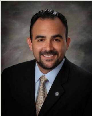
Glendale City Manager