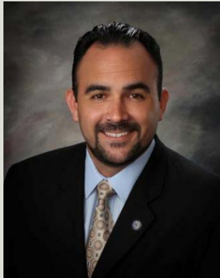
Glendale City Manager

With the beginning of June, we have the conclusion of the FY 2015-16 budget adoption process. Following two City Council budget study sessions and the Charter-required public hearing, the Council is poised to adopt a $798 million total budget, featuring a $183 million General Fund budget. While we continue to wrestle with the State of California over funding owed to the City of Glendale - as confirmed by the courts in recent litigation against the State - I am pleased and proud to state that this year's budget features a $2.7 million beginning surplus.