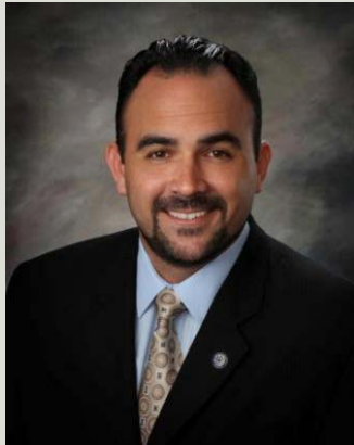
Glendale City Manager

Labor Day marks the traditional end of the summer and calls out the beginning of autumn - the season of change. This is a perfect marriage of sentiments, in my view: Labor Day - the commemoration of the sacrifice and ingenuity of American workers; and autumn - the annual metamorphosis of our environs.