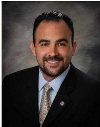
Glendale City Manager

The recent rain and wind storms presented quite a challenge for much of California. The benefits of rainfall and snowpack notwithstanding, the intensity and succession of the storms made for a cold and soggy mess. I won't complain too loudly, however, seeing as Glendale was spared the hardships that other communities had to deal with. Yet, at the same time, I would be remiss if I didn't attribute at least some of the lack of damage and disruption to the dedicated employees that are the backbone of our full-service City of Glendale.