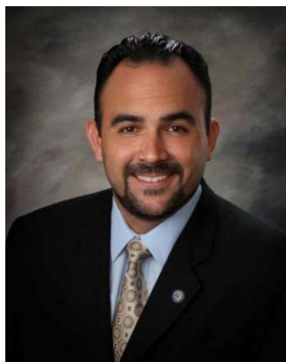
Glendale City Manager

While everyone is wondering how we're already 5 months into the year, we are prepping to close out the fiscal year and begin the New Year on July 1 st . However, before counting down from 10 and popping confetti poppers, comes the budget adoption process and City Council reorganization.