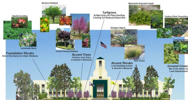
City Hall Landscape Renovation Elevation - Final 75th Anniversary of City Hall