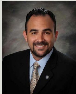
Glendale City Manager