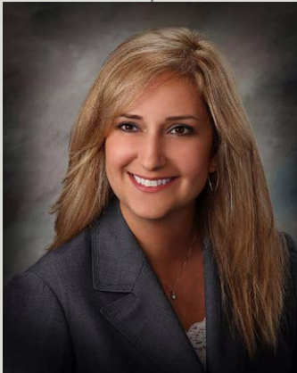
Glendale City Manager

The City of Glendale provides unmatched services to its residents and businesses – from public safety to recreation and parks, libraries, arts and culture, and quality of life programs – to help our community thrive. But by no means are we perfect or without challenges. Honestly, I can't think of a city that isn't dealing with many of the same issues as we are.