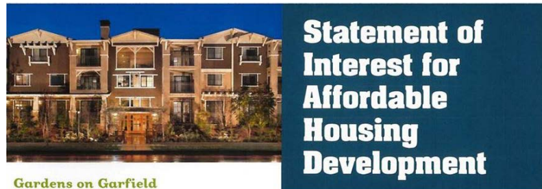
Gardens on Garfield

The Housing Authority of the City of Glendale is seeking opportunities to develop affordable housing for lower income households within Glendale. This includes the development of new affordable Renter and Ownership housing and the preservation and renovation of existing Renter housing.