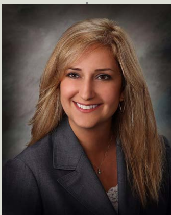
Glendale City Manager

It's officially the month of December and we are rounding out the calendar year. Wow! How time flies.