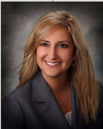
Interim City Manager

How does Glendale grow and adapt to meet the needs of its residents? How do changes in our community's make-up affect the services the City provides, the way we think about land-use, and the way people get around? These challenges are always present and are best met when residents like you are well informed and involved.