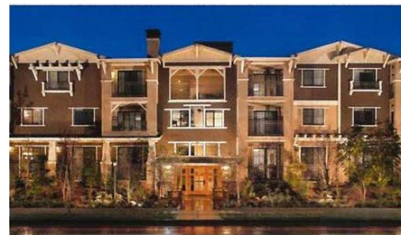
Gardens on Garfield

Statement of Interest for Affordable Housing Development