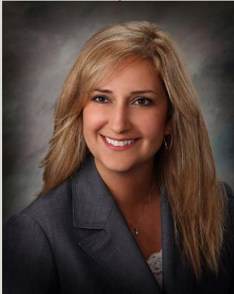
Glendale City Manager

As we prepare to head into warmer temperatures filled with swimming and other recreational water activities, it is important to know how to stay safe while you and your children are in or near the water.