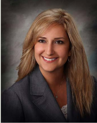
Glendale City Manager

It's that time of year again, when families and friends gather to give thanks for their blessings and reflect on the things they are grateful for. Election Day is only a few days away, and Glendale residents and individuals nationwide will be asked to cast their votes for local measures, as well as a number of other candidates and issues. This season, I am thankful for the right to vote - something that we can easily take for granted. Let's remember that there was a time in this country when not everyone had this right.