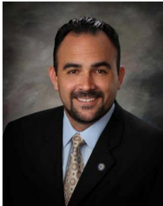
Glendale City Manager

This summer in Glendale was all about public safety. Who'd a think it? — with heat, holidays, and lots of time spent outside - summer is prime time for emergencies. This past weekend, more than 7,000 acres of land burned (about 400 acres here in Glendale) in the La Tuna Canyon Fire and tested our community's agility. With no doubt in my mind, our Fire Department fought this fast-spreading fire alongside partner agencies to save lives and property. And that they did - No structures were damaged and no one was injured as a result of the flames in Glendale.