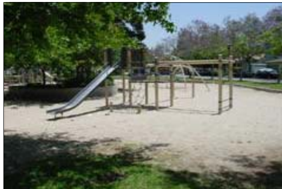
Play Equipment at the South End of the Park

Finding: The surface beneath the play equipment is sand, making the area nonaccessible to individuals with mobility impairments.