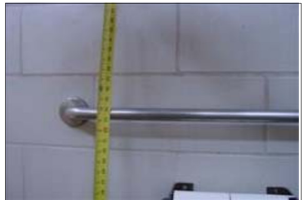
Women's Restroom Next to the Play Equipment

Full Rec: Remount the side grab bar in the stall designated to be accessible in the restroom so that the height of the gripping surface is centered at 33 inches above finished floor. Grab bars must be able to support a point load of at least 250 pounds and shall be less than the allowable shear stress of the grab bar material.