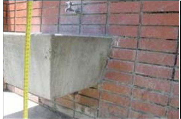
Sink at the Outdoor Dining Area

Full Rec: Raise or replace the lavatory designated to be accessible to provide at least 27 inches clear knee space (see ADAAG 4.19.2).