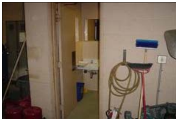
Unisex Restroom at the Maintenance Building

Finding: The clear opening width of the entrance doorway to the restroom is less than 32 inches.