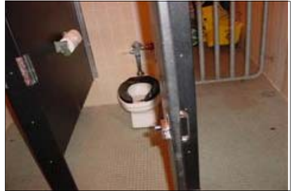
Men's Restroom at the Tennis Courts

Full Rec: Install one 36-inch back grab bar and one 42/48-inch side grab bar in the stall designated to be accessible in the restroom. Grab bars shall be mounted at a height of 33 inches above the finished floor. Grab bars must be able to support a point load of at least 250 pounds and shall be less than the allowable shear stress of the grab bar material.