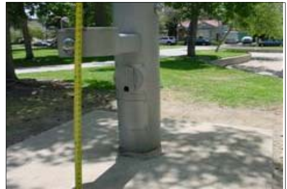
Drinking Fountain Next to the Play Equipment