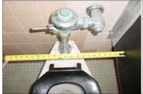
Men's Restroom at the Tennis Courts

Full Rec: Relocate the toilet or stall side wall so that the distance from the centerline of the toilet to the nearest side wall in the stall designated to be accessible in the restroom is exactly 18 inches (see ADAAG Figure 28).