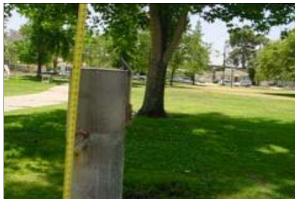
Drinking Fountain Between the Play Equipment and Tennis Courts

Finding: The drinking fountain is not a "high-low" design. The spout outlet height is greater than 36 inches. There is less than 27 inches knee clearance height.