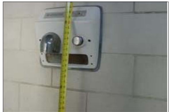
Women's Restroom Next to the Play Equipment

Full Rec: Relocate the hand dryer in the restroom to a maximum height of 40 inches for all the controls and operating mechanisms (see CBC 1115B.9.2).