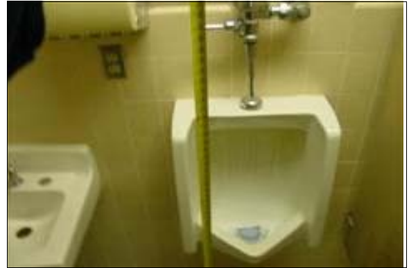
Unisex Restroom at the Maintenance Building

Full Rec: Lower the urinal designated to be accessible in the restroom so that the rim height is not more than 17 inches above the finished floor.