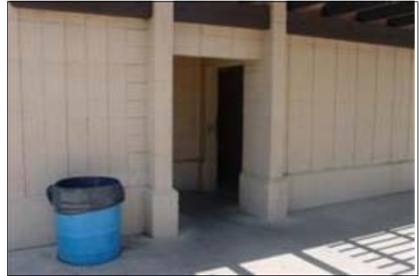
Men's Restroom at the Tennis Courts

Full Rec: Provide a level and clear landing at least 60 inches in length in the direction of the door swing.