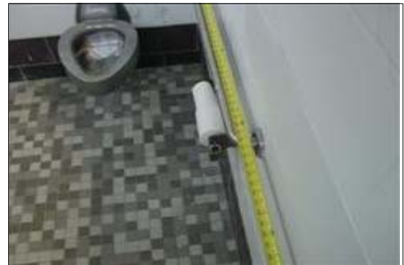
Men's Restroom Next to the Play Equipment

Full Rec: The front end of the grab bar shall extend at least 54 inches from the back wall and the back end of the grab bar shall be mounted within 12 inches from the back wall. Grab bars must be able to support a point load of at least 250 pounds and shall be less than the allowable shear stress of the grab bar material.