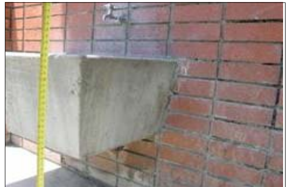
Sink at the Outdoor Dining Area

Full Rec: Relocate the sink designated to be accessible to provide a maximum counter surface height of no greater than 34 inches above the finished floor (see ADAAG 4.19.2).