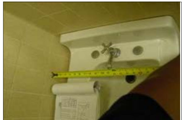
Unisex Restroom at the Maintenance Building

Full Rec: Install faucet controls complying with ADAAG 4.19.5 on the lavatory designated to be accessible in the restroom. Lever-operated, push-type, touch-type or electronically controlled mechanisms are acceptable elements (see ADAAG 4.19.5). If self-closing valves are used the faucet shall remain open for at least 10 seconds.