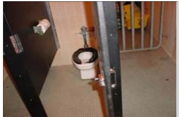
Men's Restroom at the Tennis Courts

Full Rec: Remove or modify the toilet in the stall designated to be accessible in the restroom so that the seat height is between 17 inches and 19 inches above the finished floor (see ADAAG 4.16.3).