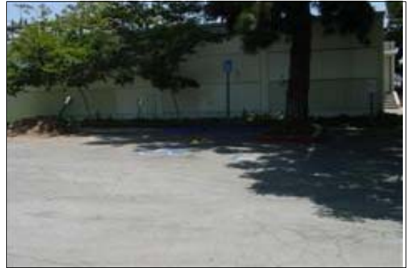
Parking Lot Outside of the Maintenance Building

Full Rec: One out of the 12 total number of marked parking space meets the number required to be designated exclusively for accessible parking, according to ADAAG and CBC 1129B. Restripe the existing parking space marked accessible to create one van-accessible parking space measuring at least 108 inches wide and 216 inches long with an access aisle measuring at least 96 inches wide (8 feet) located on the passenger side (right side) of the parking space (see CBC 1129B). Add the words NO PARKING in 12 inch high white letters at the entrance to the accessible parking access aisle.