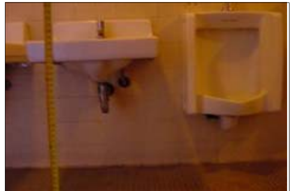
Men's Restroom at the Tennis Courts

Full Rec: Replace the lavatory designated to be accessible in the restroom to provide at least 29 inches of clear knee space between the finished floor and bottom of the lavatory apron. Make sure to provide at least 27 inches at 8 inches under the apron (see ADAAG 4.19.2).