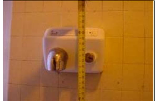
Men's Restroom at the Tennis Courts

Full Rec: Relocate the hand dryer in the restroom to a maximum height of 40 inches for all the controls and operating mechanisms (see CBC 1115B.9.2).