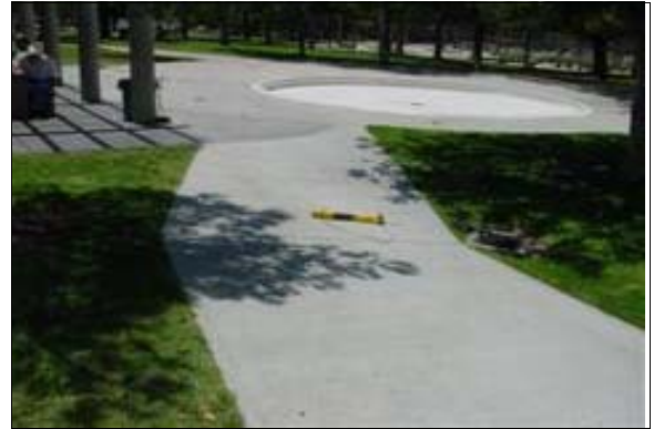
Path of Travel to the Wading Pool

Full Rec: Resurface the path of travel to provide a level surface that does not exceed a slope greater than 5%. Cross slopes shall not exceed 2%.