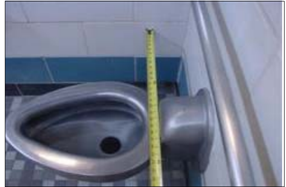
Women's Restroom Next to the Play Equipment

Full Rec: Relocate the toilet or stall side wall so that the distance from the centerline of the toilet to the nearest side wall in the stall designated to be accessible in the restroom is exactly 18 inches (see ADAAG Figure 28).