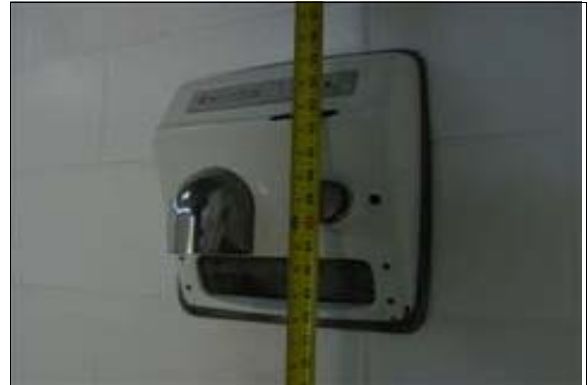
Men's Restroom Next to the Play Equipment

Full Rec: Relocate the hand dryer in the restroom to a maximum height of 40 inches for all the controls and operating mechanisms (see CBC 1115B.9.2).