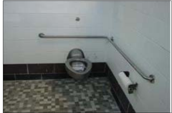
Men's Restroom Next to the Play Equipment

Full Rec: Relocate the flush control on the toilet in the stall designated to be accessible in the restroom so that it is on the wide (approach) side of the toilet area (see ADAAG 4.16.5). Flush controls shall be hand-operated or automatic mechanisms.