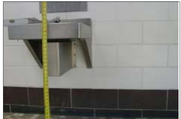
Men's Restroom Next to the Play Equipment

Full Rec: Raise or replace the lavatory designated to be accessible in the restroom to provide at least 27 inches at 8 inches under the apron. Make sure to provide at least 29 inches of clear knee space between the finished floor and bottom of the lavatory apron and a rim surface height no greater than 34 inches (see ADAAG 4.19.2).