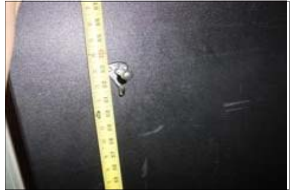
Women's Restroom at the Tennis Courts

Full Rec: Remount the coat hook on the stall door designated to be accessible in the restroom to a maximum height of 48 inches above the floor surface.