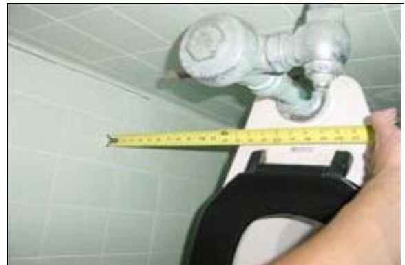
Women's Restroom at the Tennis Courts

Full Rec: Relocate the toilet or stall side wall so that the distance from the centerline of the toilet to the nearest side wall in the stall designated to be accessible in the restroom is exactly 18 inches (see ADAAG Figure 28).