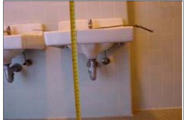
Women's Restroom at the Tennis Courts

Full Rec: Replace the lavatory designated to be accessible in the restroom to provide at least 29 inches of clear knee space between the finished floor and bottom of the lavatory apron. Make sure to provide at least 27 inches at 8 inches under the apron (see ADAAG 4.19.2).