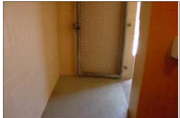
Men's Restroom at the Tennis Courts

Citations: CBC 1133B.2.4.2; ADAAG 4.13.6