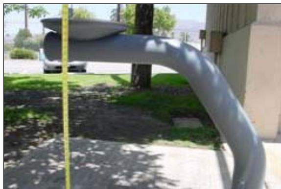
Drinking Fountain Outside of the Tennis Office

Finding: The drinking fountain is not a "high-low" design.