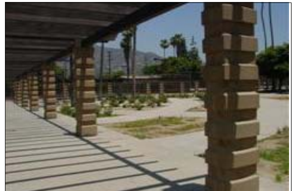
Open Tree Wells

Finding: There are open tree wells along the path of travel next to the tennis courts with a change in elevation greater than 1/2 inch, creating a tripping hazard.