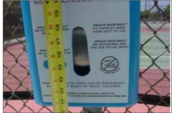
Dog Walk Bags

Finding: The highest operable part of the dog walk bags exceeds the forward reach range of 48 inches.