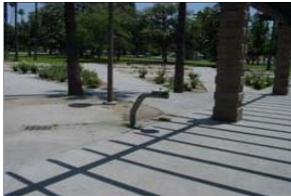
Drinking Fountain Between the Tennis Courts

Finding: The drinking fountain is not a "high-low" design.