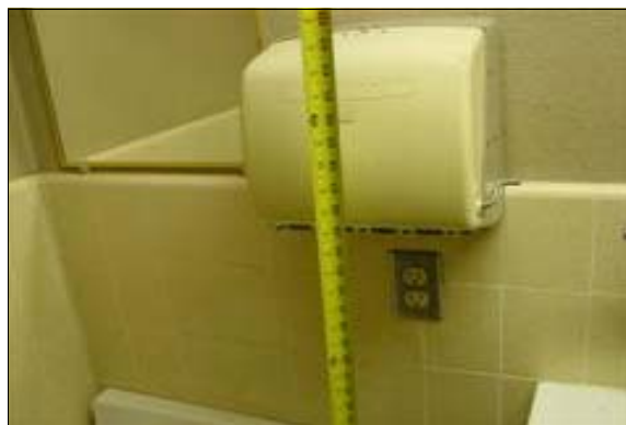
Unisex Restroom at the Maintenance Building

Finding: The bottom edge of the reflecting surface of the mirror in the restroom is greater than 40 inches above the finished floor.