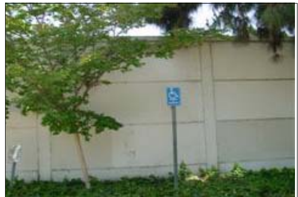
Parking Lot Outside of the Maintenance Building

Finding: The vertically-mounted signage at the designated accessible parking space in the parking lot showing the International Symbol of Accessibility uses the word "handicapped". The bottom edge of the post-mounted signage designating the accessible parking space is less than 80 inches above the level of the parking space and cannot be viewed when a vehicle is parked in the space.