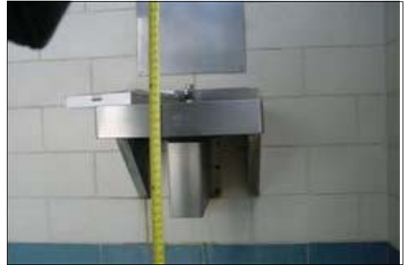
Women's Restroom Next to the Play Equipment

Full Rec: Raise or replace the lavatory designated to be accessible in the restroom to provide at least 27 inches at 8 inches under the apron. Make sure to provide at least 29 inches of clear knee space between the finished floor and bottom of the lavatory apron and a rim surface height no greater than 34 inches (see ADAAG 4.19.2).