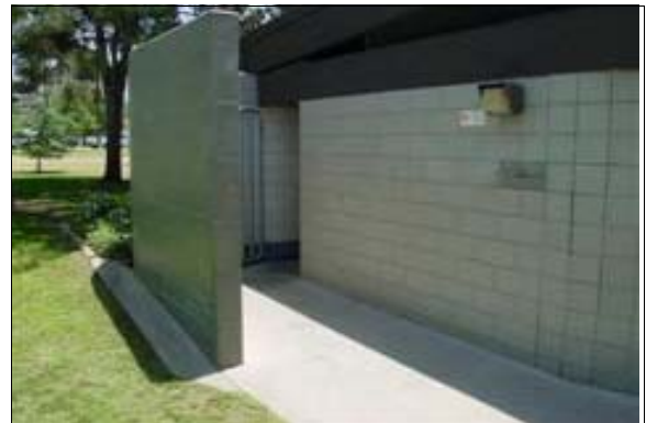
Women's Restroom Next to the Play Equipment

Full Rec: The restroom is designated accessible and should be made accessible for the facility. Post signage centered 60 inches above the ground surface on the latch side of the entrance door identifying the restroom as accessible upon completion of the following items (see CBC 1115B., ADAAG 4.1.2(7) and ADAAG 4.1.6(3)(e). Signage shall include Braille and raised lettering, the gender or unisex use symbol and the ISA symbol. Post Title 24 gender use signage on the door @ 60" o.c. a.f.f.