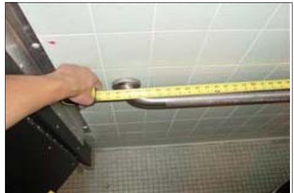
Women's Restroom at the Tennis Courts

Full Rec: The front end of the grab bar shall extend at least 54 inches from the back wall and the back end of the grab bar shall be mounted within 12 inches from the back wall. Grab bars must be able to support a point load of at least 250 pounds and shall be less than the allowable shear stress of the grab bar material.