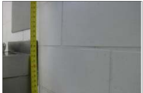
Men's Restroom Next to the Play Equipment

Full Rec: Lower the mirror in the restroom so that the bottom edge of the reflecting surface is no higher than 40 inches above the finished floor and the topmost portion of the reflecting surface extends at least 74 inches above the finished floor (see ADAAG A4.19.6). A single, full-length mirror is recommended since it can accommodate all people. Make certain to provide a minimum clear floor space in front of the mirror of 30 inches in width and 48 inches in length.