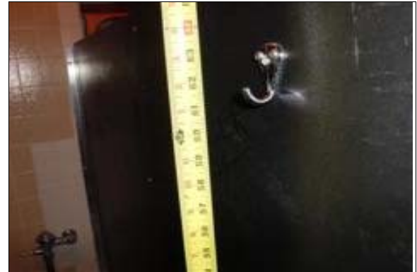
Men's Restroom at the Tennis Courts