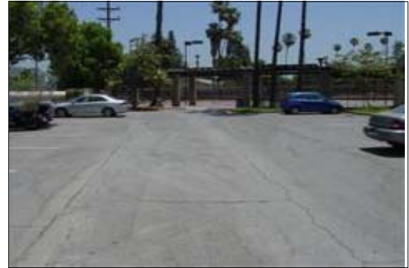
Parking Lot Next to the Tennis Courts

Full Rec: Install a permanently posted reflectorized sign measuring 70 square inches that includes an ISA symbol adjacent to and visible from each accessible parking space (see CBC 1129B.5). The bottom edge of each sign must be mounted 80 inches from the ground surface so that it cannot be obscured by a parked vehicle (see CBC 1129B.5). The "van-accessible" parking space shall provide an additional sign marked "van-accessible" mounted below the sign (see CBC 1129B.5 and ADAAG 4.6.4).