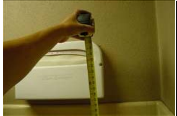
Unisex Restroom at the Maintenance Building

Full Rec: Relocate the seat cover dispenser in the stall designated to be accessible in the restroom so that the height is no greater than 40 inches above the finished floor (see CBC 1115B.9.2). Make certain that the location of the seat cover dispenser does not interfere with the use of a grab bar and provides sufficient clear floor space.