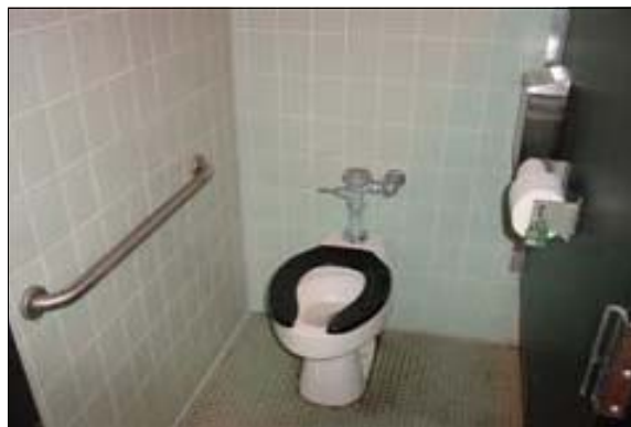
Women's Restroom at the Tennis Courts

Finding: There is insufficient clear floor space in the stall designated to be accessible in the restroom. The door to the stall designated to be accessible in the restroom does not have accessible hardware.