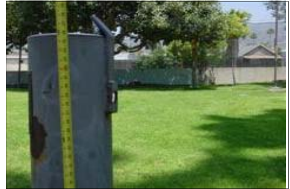
Drinking Fountain Next to the Maintenance Building

Full Rec: Fifty percent of the drinking fountains on primary paths of travel shall be accessible (see CBC 1117B.1 and ADAAG 4.15). Install a "high-low" fountain design to comply with both state and federal requirements and install a side rail or wing wall next to each side of the fountain.