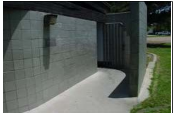
Men's Restroom Next to the Play Equipment

Full Rec: The restroom is designated accessible and should be made accessible for the facility. Post signage centered 60 inches above the ground surface on the latch side of the entrance door identifying the restroom as accessible upon completion of the following items (see CBC 1115B., ADAAG 4.1.2(7) and ADAAG 4.1.6(3)(e)). Signage shall include Braille and raised lettering, the gender or unisex use symbol and the ISA symbol. Post Title 24 gender use signage on the door @ 60" o.c. a.f.f.