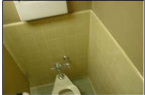
Unisex Restroom at the Maintenance Building

Full Rec: Remove or modify the toilet in the stall designated to be accessible in the restroom so that the seat height is between 17 inches and 19 inches above the finished floor (see ADAAG 4.16.3).