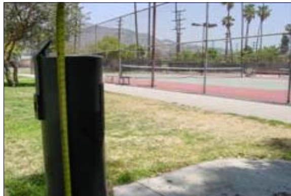
Drinking Fountain Next to the Tennis Courts

Finding: The drinking fountain is not a "high-low" design. The spout outlet height is greater than 36 inches. There is less than 27 inches knee clearance height.