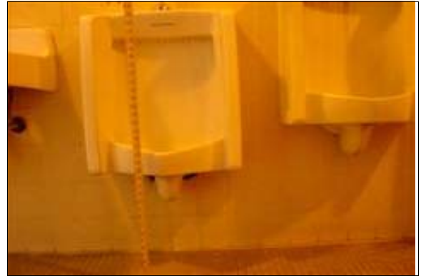
Men's Restroom at the Tennis Courts

Full Rec: Lower the urinal designated to be accessible in the restroom so that the rim height is not more than 17 inches above the finished floor.