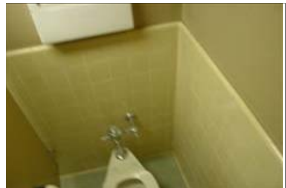
Unisex Restroom at the Maintenance Building