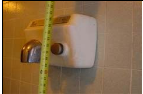
Women's Restroom at the Tennis Courts

Full Rec: Relocate the hand dryer in the restroom to a maximum height of 40 inches for all the controls and operating mechanisms (see CBC 1115B.9.2).