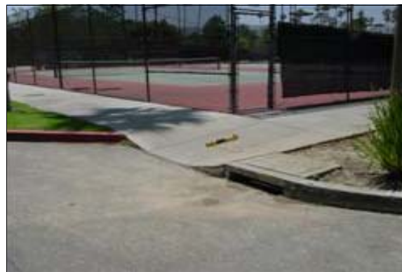
Curb Ramp Next to the Tennis Courts

Full Rec: Replace the curb ramp with a compliant curb ramp at least 48 inches in width that provides a slope no greater than 8.33%. Install a detectable warning surface which extends the full length and width of the concrete curb ramp and its side flares with truncated domes that contrast visually by either light on dark or dark on light which is an integral part of the concrete curb ramp. The truncated domes may be cast in place or stamped or of a prefabricated surface treatment (see CBC 1127B.5.8).