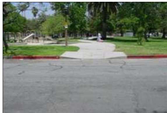
Curb Ramp off of Fremont

Full Rec: Replace the curb ramp with a compliant curb ramp at least 48 inches in width that provides a slope no greater than 8.33%. Install a detectable warning surface which extends the full length and width of the concrete curb ramp and its side flares with truncated domes that contrast visually by either light on dark or dark on light which is an integral part of the concrete curb ramp. The truncated domes may be cast in place or stamped or of a prefabricated surface treatment (see CBC 1127B.5.8).