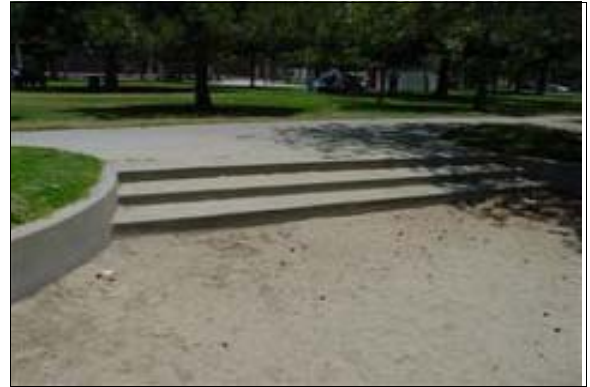
Exterior Stairs to the Play Area

Full Rec: Affix detectable contrasting striping to each tread of the stairway that clearly contrasts in color from the tread and is at least 2 inches in width placed no more than 1 inch from the tread nose or landing.