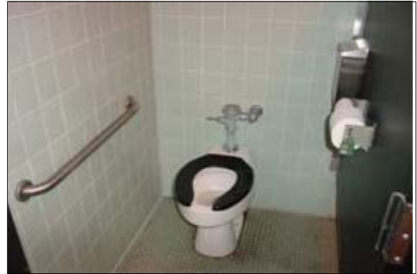
Women's Restroom at the Tennis Courts

Full Rec: Relocate the flush control on the toilet in the stall designated to be accessible in the restroom so that it is on the wide (approach) side of the toilet area (see ADAAG 4.16.5). Flush controls shall be hand-operated or automatic mechanisms.