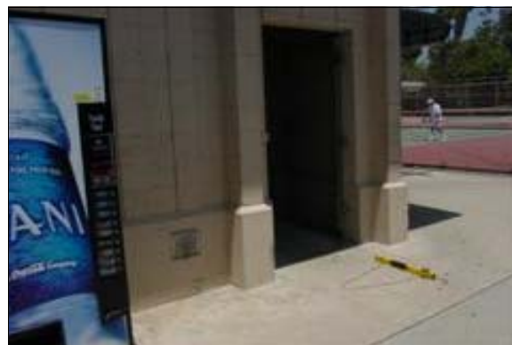
Women's Restroom at the Tennis Courts

Full Rec: The restroom is designated accessible and should be made accessible for the facility. Post signage centered 60 inches above the ground surface on the latch side of the entrance door identifying the restroom as accessible upon completion of the following items (see CBC 1115B., ADAAG 4.1.2(7) and ADAAG 4.1.6(3)(e). Signage shall include Braille and raised lettering, the gender or unisex use symbol and the ISA symbol. Post Title 24 gender use signage on the door @ 60" o.c. a.f.f.