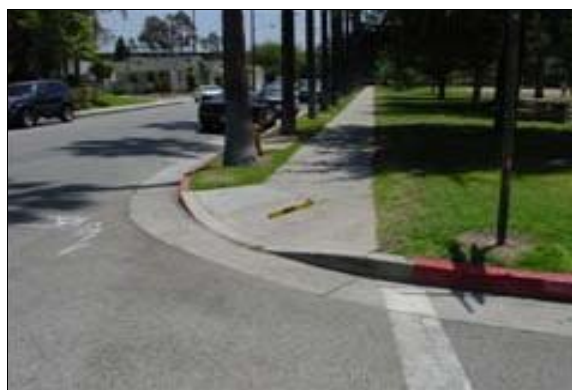
Curb Ramp at the Corner of Hahn Ave and Kenilworth Ave

Finding: The slope of the curb ramp is greater than 8.33%. The slope at the bottom landing is greater than 2%. The slope of the side flares is greater than 2%. The curb ramp does not provide a grooved border along the top and sides of the ramp at the level of the sidewalk. The concrete curb ramp does not provide a detectable warning surface which includes truncated domes.