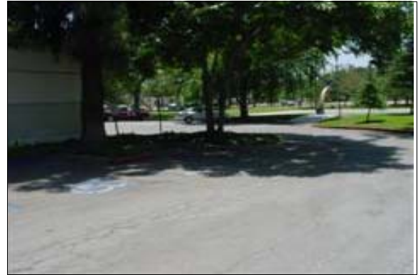
Parking Lot Outside of the Maintenance Building

Full Rec: Stripe a crosswalk not less than 48 inches wide on the path of travel to the accessible entrance. Provide a level surface that does not exceed a slope greater than 5%. Cross slopes shall not exceed 2%. Detectable warnings should be placed at the entrance and exit of the crosswalk.