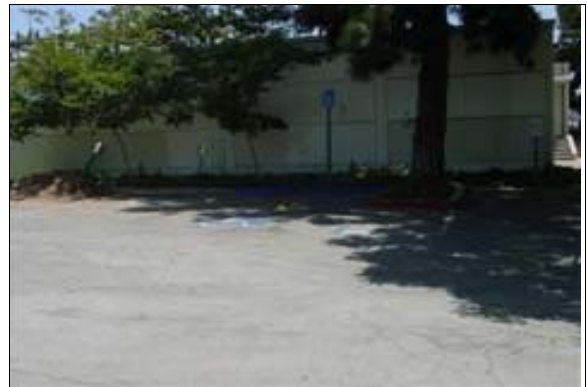
Parking Lot Outside of the Maintenance Building

Full Rec: Pave the parking lot at the accessible spaces to provide a level surface. Parking surfaces and access aisles shall be located in areas not exceeding 2% slope in all directions (see CBC 1129B and ADAAG 4.6.3).