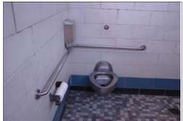
Women's Restroom Next to the Play Equipment

Full Rec: Remount the feminine product disposal in the stall designated to be accessible in the restroom so that it does not interfere with the use of the side grab bar.