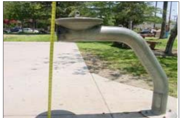
Drinking Fountain at the Basketball Courts

Full Rec: Fifty percent of the drinking fountains on primary paths of travel shall be accessible (see CBC 1117B.1 and ADAAG 4.15). Install a "high-low" fountain design to comply with both state and federal requirements and install a side rail or wing wall next to each side of the fountain.