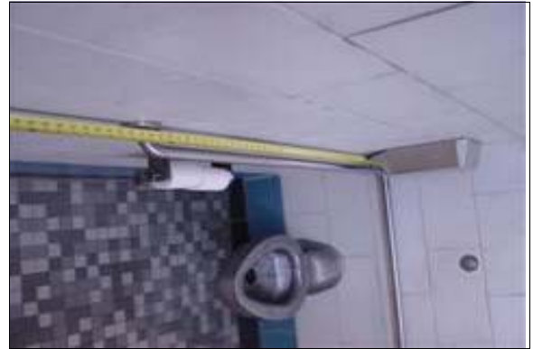
Women's Restroom Next to the Play Equipment

Full Rec: The front end of the grab bar shall extend at least 54 inches from the back wall and the back end of the grab bar shall be mounted within 12 inches from the back wall. Grab bars must be able to support a point load of at least 250 pounds and shall be less than the allowable shear stress of the grab bar material.