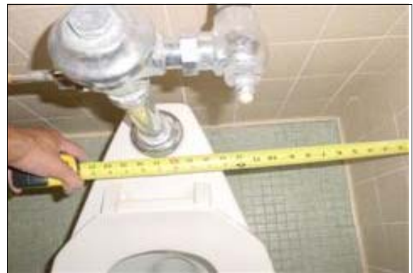
Unisex Restroom at the Maintenance Building

Full Rec: Relocate the toilet or stall side wall so that the distance from the centerline of the toilet to the nearest side wall in the stall designated to be accessible in the restroom is exactly 18 inches (see ADAAG Figure 28).