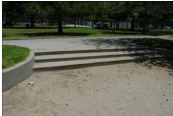
Play Equipment at the South End of the Park

Finding: There are only stairs on the path of travel to the play area, preventing access to individuals with mobility impairments.