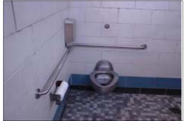
Women's Restroom Next to the Play Equipment

Full Rec: Install a door with appropriate accessible door hardware on the stall designated to be accessible in the restroom (see CBC 1115B.7.1.3 and ADAAG 4.13.9).