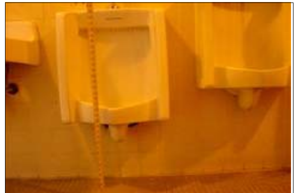
Men's Restroom at the Tennis Courts

Full Rec: Lower the flush control valve on the urinal designated to be accessible in the restroom to a height not greater than 44 inches above the finished floor (see ADAAG 4.18.4).