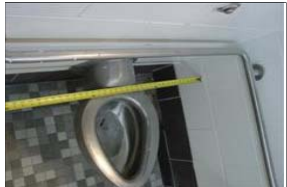
Men's Restroom Next to the Play Equipment

Full Rec: Relocate the toilet or stall side wall so that the distance from the centerline of the toilet to the nearest side wall in the stall designated to be accessible in the restroom is exactly 18 inches (see ADAAG Figure 28).