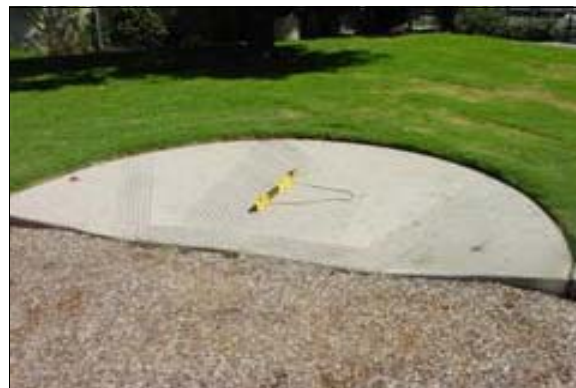
Curb Ramp at the Play Equipment

Citations: CBC 1127B.5.3; ADAAG 4.7.2 & 4.29