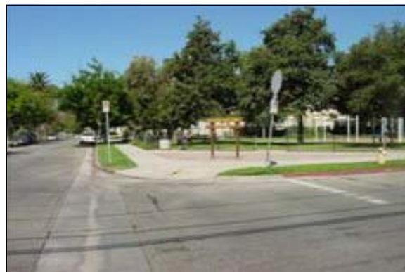
Accessible Route from the Public Right of Way

Full Rec: Post directional signage. Make certain to post signage indicating the direction to accessible building entrances at every major junction along the accessible route. Signs shall include the International Symbol of Accessibility.