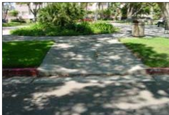
Curb Ramp (East)

Finding: The slope of the curb ramp is greater than 8.33%. The concrete curb ramp does not provide a detectable warning surface which includes truncated domes.