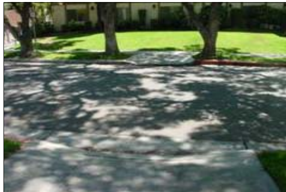
Path of Travel to the Park

Finding: There is no crosswalk provided on the path of travel to the (east) curb ramp. The required accessible route crosses a vehicular way.