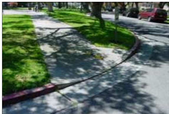
Curb Ramp (West)

Finding: The slope of the curb ramp is greater than 8.33%. The slope at the top landing is greater than 2%. The slope of the side flares is greater than 10%. The curb ramp does not provide a grooved border along the top and sides of the ramp at the level of the sidewalk. The concrete curb ramp does not provide a detectable warning surface which includes truncated domes.