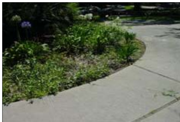
Open Tree Well

Finding: There is an open tree well along the path of travel with a change in elevation greater than 1/2 inch, creating a tripping hazard.