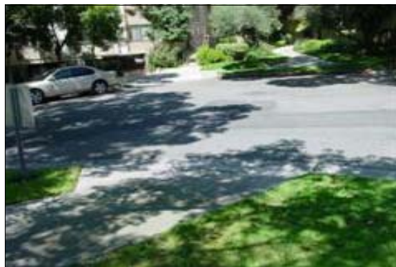
Path of Travel to the Park

Finding: There is no crosswalk provided on the path of travel to the (west) curb ramp. The required accessible route crosses a vehicular way.