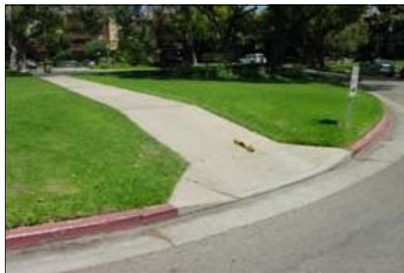
Curb Ramp (South)

Finding: The slope of the curb ramp is greater than 8.33%. The transition at the bottom landing is abrupt. The curb ramp does not provide a grooved border along the top and sides of the ramp at the level of the sidewalk. The concrete curb ramp does not provide a detectable warning surface which includes truncated domes.