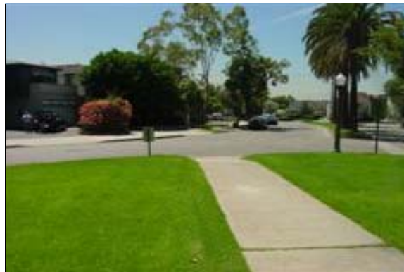
Accessible Route from the Public Right of Way

Finding: There is an accessible route from the public right of way to the accessible entrance of the facility.