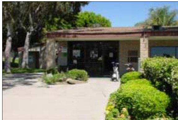
Scholl Canyon Club House