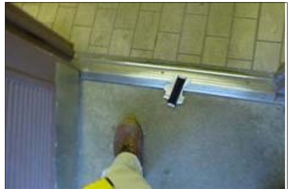
Men's Restroom at the Clubhouse

Full Rec: Modify or replace the threshold to provide a smooth transition. The threshold should not exceed a beveled 1/2 inch. Provide a 60 inch level landing in the direction of the door swing.