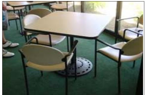
Scholl Canyon Café

Full Rec: Modify or replace one of the tables in the Café to provide knee clearance of at least 27 inches in height, 30 inches in width and 19 inches in depth (see CBC 1122B.3, ADAAG 4.32.2 and ADAAG Figure 45). The table top height shall not exceed 34 inches above the finished floor.