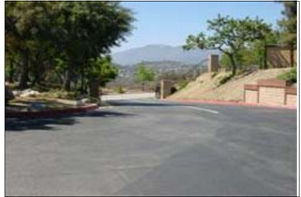
Accessible Route from the Public Right of Way