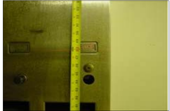
Women's Restroom at the Clubhouse

Full Rec: Relocate the feminine products dispenser in the restroom to a maximum height of 40 inches for all the controls and operating mechanisms (see CBC 1115B.9.2).