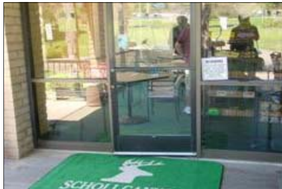
Scholl Canyon Café