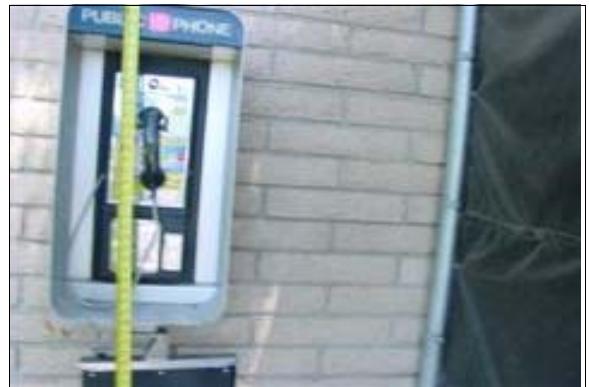
Pay Telephone Outside of the Restrooms

Full Rec: Contact the telephone company that owns the pay telephone regarding the height of all the operating devices on the telephone.