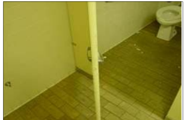
Women's Restroom at the Clubhouse

Full Rec: Provide an automatic door closer, spring hinge, pull bar or accessible handle mounted on the inside of the stall door to the stall designated to be accessible in the restroom (see ADAAG A4.17.5). Accessible hardware on the inside and outside of the stall designated to be accessible door shall be equipped with a loop or U-shaped handle mounted immediately below the latch. The latch shall be flip-over style, sliding or other hardware not requiring grasping or twisting. Make certain that the inside and outside door hardware is mounted no more than 48 inches above the finished floor (see CBC 115B.7.1.3 and ADAAG 4.13.9).