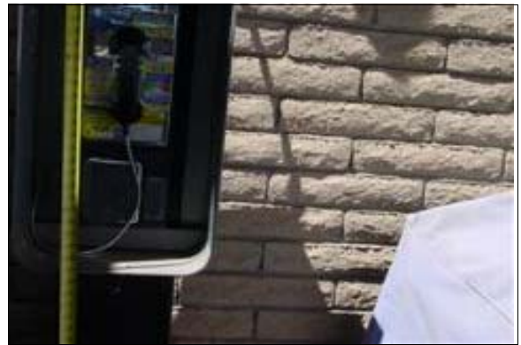
Pay Telephone Outside of the Café

Full Rec: Electrical outlets within or adjacent to the telephone enclosure are required at pay telephones designed to accommodate a portable text telephone.