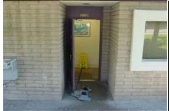
Men's Restroom at the Clubhouse

Full Rec: The restroom is designated accessible and should be made accessible for the facility. Post signage centered 60 inches above the ground surface on the latch side of the entrance door identifying the restroom as accessible upon completion of the following items (see CBC 1115B., ADAAG 4.1.2(7) and ADAAG 4.1.6(3)(e). Signage shall include Braille and raised lettering, the gender or unisex use symbol and the ISA symbol. Post Title 24 gender use signage on the door @ 60" o.c. a.f.f.