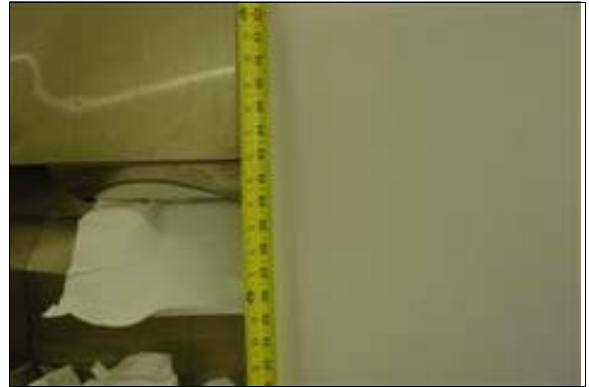
Men's Restroom at the Clubhouse

Full Rec: Relocate the paper towel dispenser in the restroom to a maximum height of 40 inches for all the controls and operating mechanisms (see CBC 1115B.9.2).