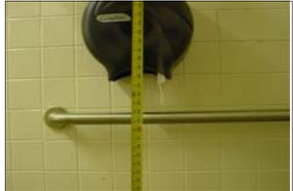
Men's Restroom at the Clubhouse