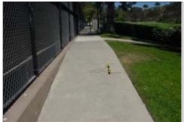
Path of Travel to Tennis Courts 7 thru 10

Citations: CBC 1133B.7.1.3; CBC 1133B.7.3; ADAAG 4.3.7