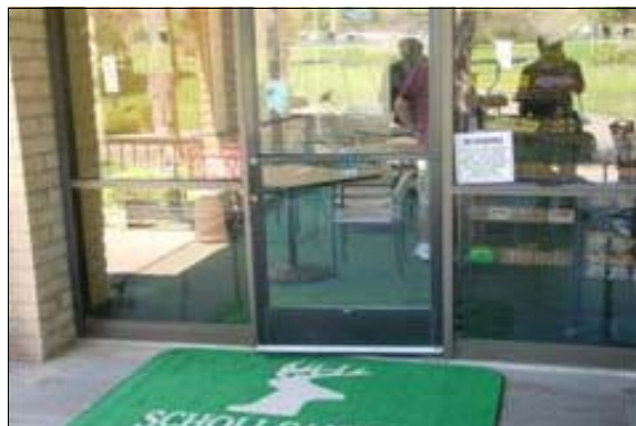
Scholl Canyon Café