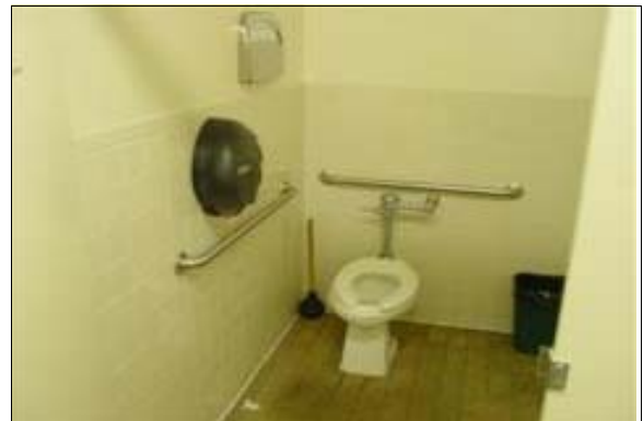
Men's Restroom at the Clubhouse