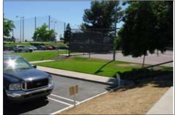
Tennis Courts 1 and 2