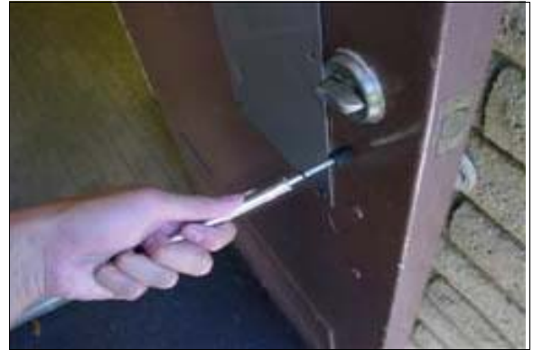
Women's Restroom at the Clubhouse

Full Rec: Adjust the closers on all exterior doors to a maximum door opening force of 5 pounds of force (see ADAAG 4.13.11 and CBC 1133B.2.5).